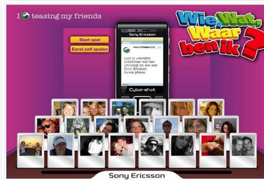
Fig. 4. Sony Ericsson's “who, what, where am I?” advertisement.