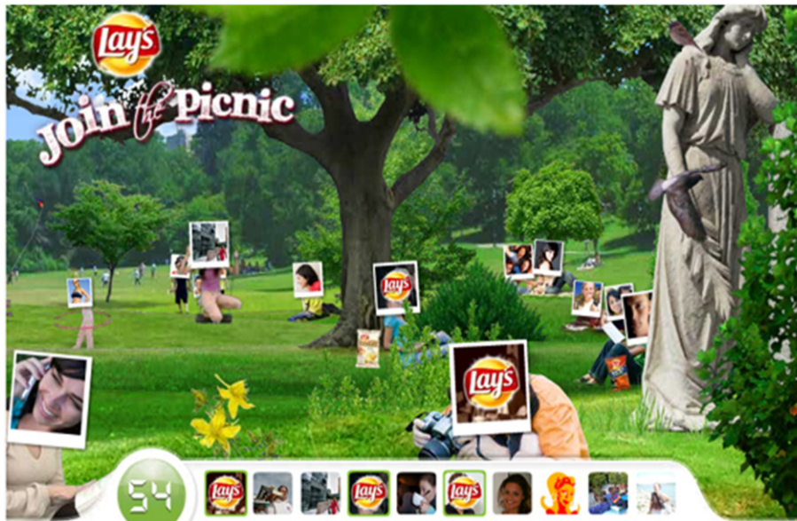
Fig. 2. Lay's "Join the Picnic" advertisement.

1.10), this construct was not used as a linear variable in the analyses, but a dichotomous variable was created, indicating daily use or non-daily use.