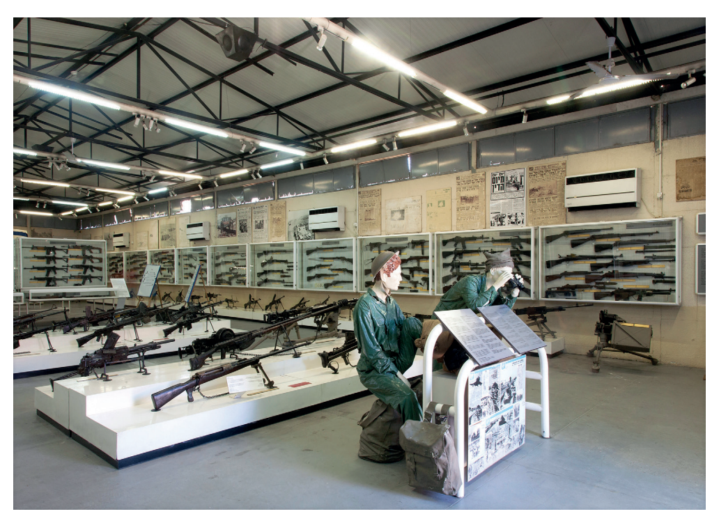
FIGURE 5. ILYA RABINOVICH, MUSEUTOPIA, CHAPTER II (DETAIL). FROM IDF HISTORY MUSEUM, TEL AVIV.

a staging of a soldier's sleeping room in the Israeli Defence Forces History Museum. The photograph underscores an attempt at a genuine reenactment, including the placing of personal equipment in different locations in the room and posters on