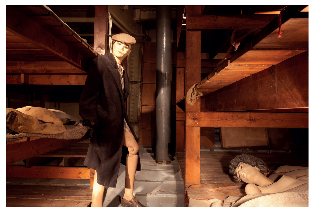
FIGURE 6. ILYA RABINOVICH, MUSEUTOPIA, CHAPTER II. DETAILS. FROM THE CLANDESTINE IMMIGRATION AND NAVAL MUSEUM, HAIFA. Courtesy of the artist.

of their visitors arrive in organized groups of school classes, soldiers on a cultural excursion, or tourists.<sup>24</sup> The visitors of such museums are mostly insiders: future, present, or past participants in the military and security institutions. They are, in a sense, potential protagonists in their capacity as soldier-citizens.