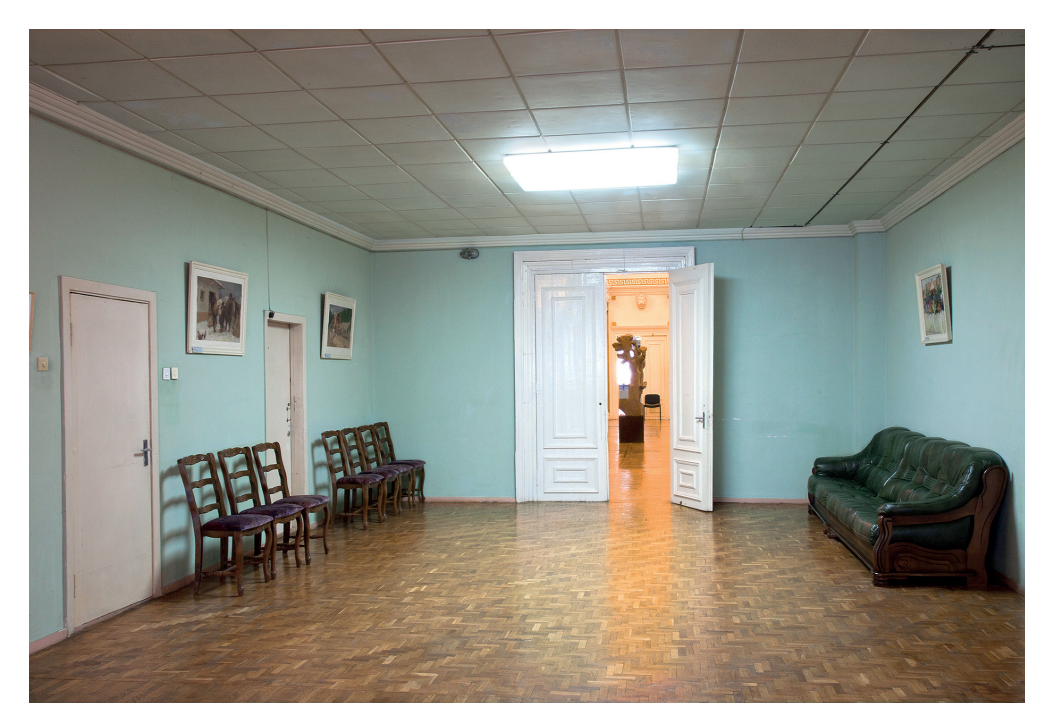
FIGURE 2. ILYA RABINOVICH, MUSEUTOPIA (DETAIL). FROM THE NATIONAL MUSEUM OF HISTORY AND ARCHAEOLOGY. CHIŞINĂU 2008. Courtesy of the artist.

fact that such re-telling is made only on the overt, superficial level of the historical narrative. The obliterated historical moment that the artist was searching for could still make itself available to his attentive gaze, and through him, to us. What started out as a personal project, a quest for roots, information, and clarity, ended with an insight into the role of repressed narratives within one's psyche, whether one is an individual body, or a collective national one. If the historical museum commonly works expropriate the individual's narrative and embed it within the collective, the narrative that is being embedded here is that of repression, which nevertheless continues to structure one's perspective.