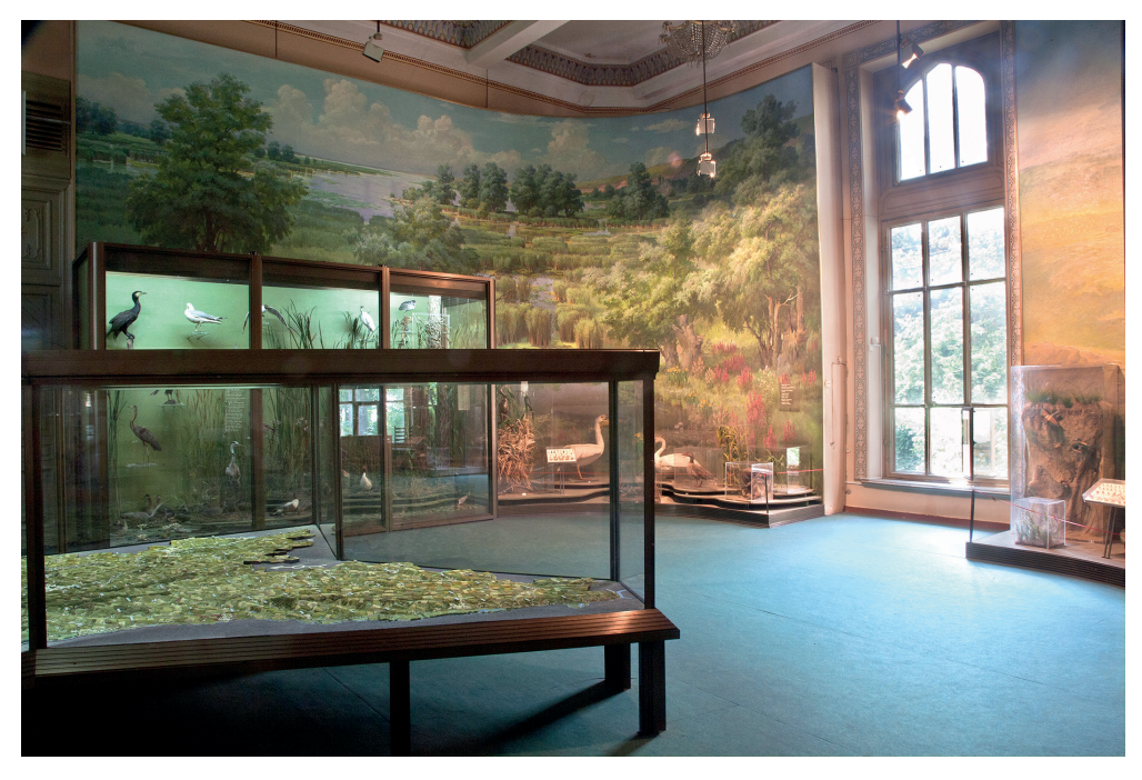
FIGURE 1. ILYA RABINOVICH, MUSEUTOPIA (DETAIL). FROM THE NATIONAL MUSEUM OF ETHNOGRAPHY AND NATURAL HISTORY, CHIŞINĂU, 2008.

with his own photographs, to juxtapose the museum's displays during and after Moldova's communist episode.<sup>10</sup> Moldova was incorporated into the USSR during the 1940s and remained under Russian Communist rule for about five decades. With the collapse of the Soviet Union, Moldova declared itself an independent state in 1991. Rabinovich's collages, presented on eleven large panels that included also elaborate captions, delineate a pivotal change in the way Moldova narrated its official history, during and after soviet rule. In a didactic manner, the collages point to a decisive forgetfulness that materialized in a radical reconfiguration of Moldova's history.