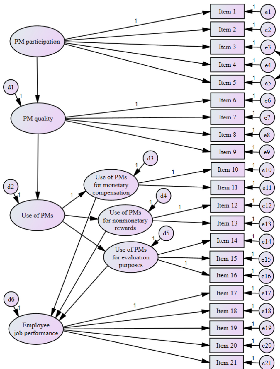
Fig. B1. Graphical representation of the structural model, including the second-order construct Use of PMs and its underlying first-order constructs.