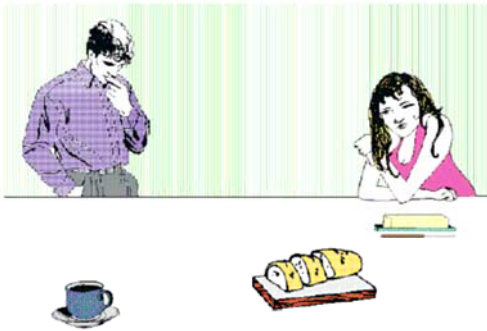
Figure 1.1 Example of a display used in (Kamide, Altmann, & Haywood, 2003).

a less constraining context (“ The woman will slide ... ”) no such preference for a specific object was detected. This indicates that the listeners were thinking about butter before the word “butter” had actually been pronounced, i.e. that they predicted that the word butter would follow. Of course, the visual display already limited the possibilities for the words that could follow. So, even though the results are certainly suggestive, this experiment does not provide definite evidence that prediction occurs in normal language comprehension.