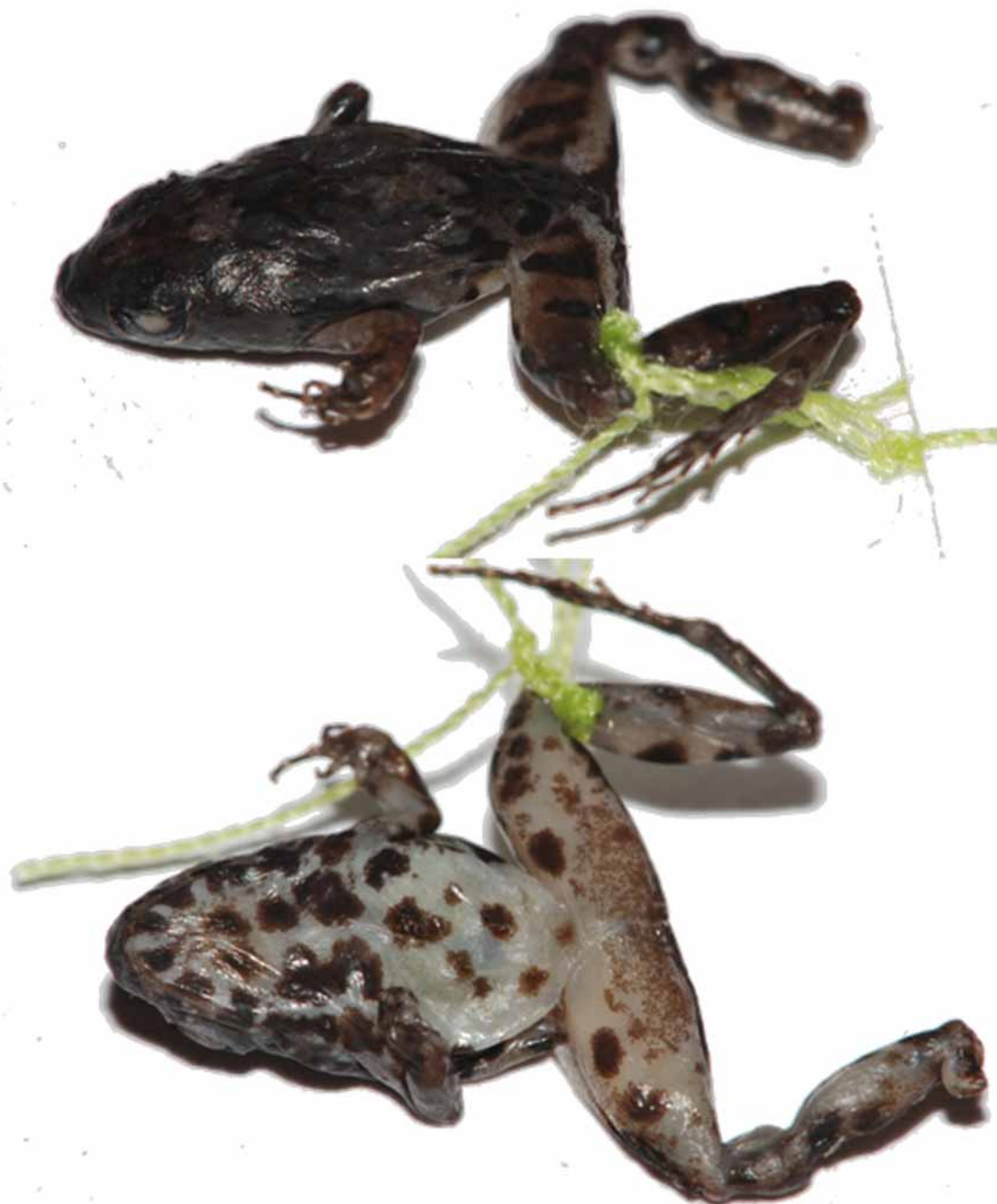
FIGURE 1. Dorsolateral and ventral view of Phrynobatrachus pintoii sp. nov. (ZMB 70689, holotype).

Small, compact Phrynobatrachus , characterized by combination of warty back; warty eyelids (eyelid cornicle absent); large dark spots on white throat, breast and belly; rudimentary webbing.