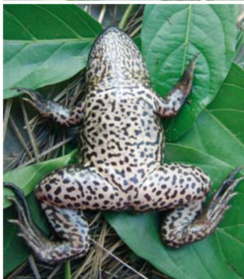
Fig. 5. Dorso-lateral and ventral view of an undescrbed Conraua species from the Saala Waterfalls (see Fig. 3).

7) around the Touri Dam. Based on their general distribution area, both species were supposed to occur in Guinea (RÖDEL 2000). Kassina fusca was represented by individuals that were unusually small. Male K. fusca reached 27.5–32.5 mm SVL ( N = 5 ; 31–35 mm according to RÖDEL 2000), while a female measured 30.4 mm SVL (32–37 mm according to RÖDEL 2000; 29–33 mm SVL for both sexes according to SCHIÖTZ 1967).