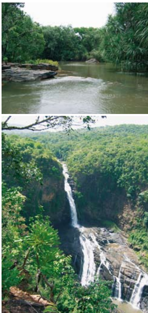
Fig. 3. Saala River and Saala Waterfall, the habitat of an undescribed Conraua species (see Fig. 5).

The second study site, the Nialama Classified Forest (1-3 June; 204-473 m a.s.l.; Fig. 2) was characterised by an open dry forest as well as farmbush and savanna habitats. It included several streams with narrow gallery forests that have been partly logged. An important part of Nialama Forest was characterised by mature secondary forest resulting from reforestation actions. Within the farmbush and savanna habitats rainfall leads to