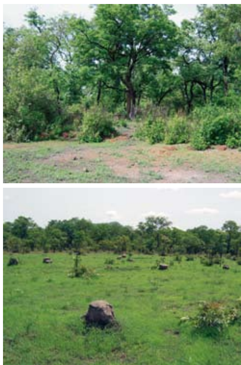
Fig. 2. Two typical aspects of the landscape in the Nialama Forest area; the open dry forest and the “bowal” savanna.

crosses the river. There is ongoing construction of a tourist camp, while no measures have been taken to cater for waste or sanitary infrastructure. The forest around the Saala Waterfalls still harbours a big population of chimpanzees (E.O. TOUNKARA, pers. comm.) and an ornithological survey revealed a high diversity of birds (N. KEITA & R. DEMEY, pers. comm.).