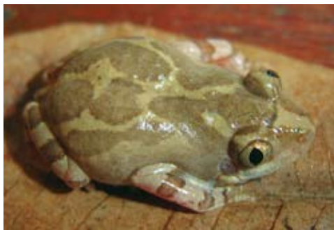
Fig. 6. Kassina fusca from the Nialama Forest area. This is a relatively common West African savanna species, herein recorded for the first time in Guinea.

The majority of species (14 species, 56%) has a distribution range exceeding West Af-