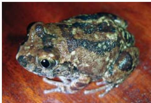
Fig. 7. Leptopelis bufonoides is a very patchily distributed savanna frog, occurring from Senegal to northern Cameroon. The record from the Touri Dam is a first Guinean record. This individual shows an unusual pattern with yellowish spots on the back.

River. The area around these rocks was rather open and frequently visited by humans who crossed the river exactly where Conraua sp. occurred. As rainfall was still rare, we were not able to observe if the habitat preference of the frogs changed with a rising water level.