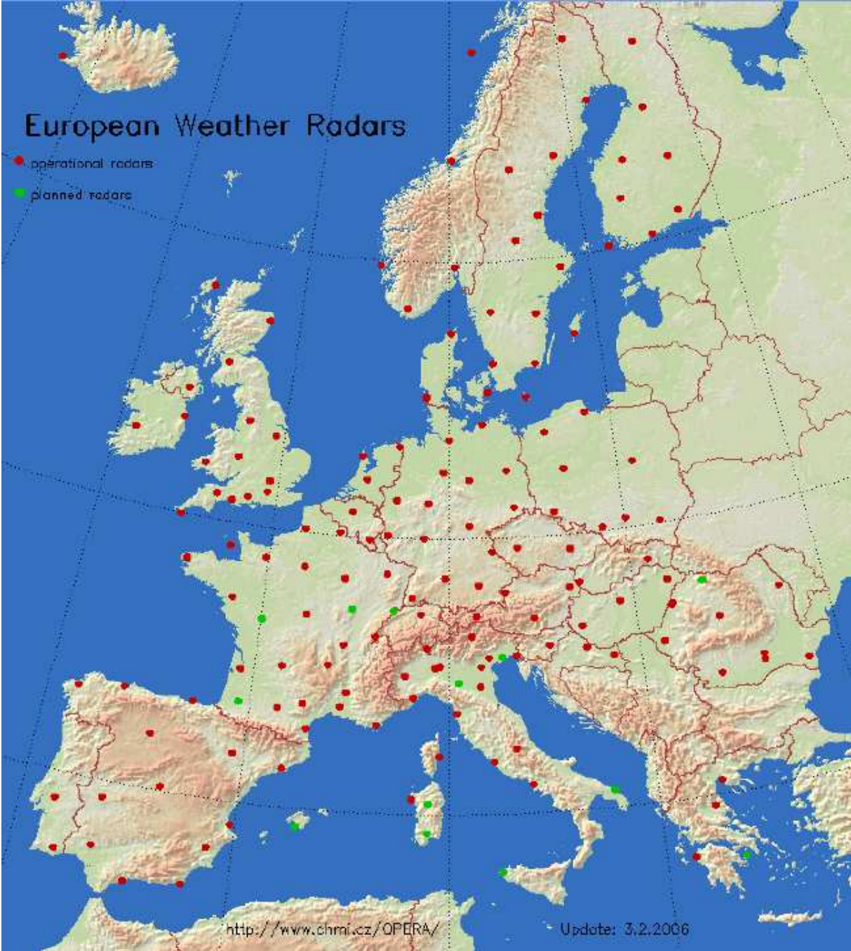
Fig. 1: Weather radars in OPERA and EUMETNET member countries. The map is based on entries stored at the OPERA public data base in January 2007 (from Holleman & Delobbe, 2007).