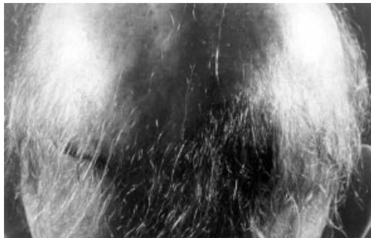
Figure 1 The typical scanty scalp hair that can be seen in all phenotypes. This patient with AMN developed the hair pattern during adolescence.

At least in The Netherlands, AMN (fig 5) is the most common phenotype of X-ALD. 16 The onset of neurological symptoms in this phenotype usually occurs in the third and fourth