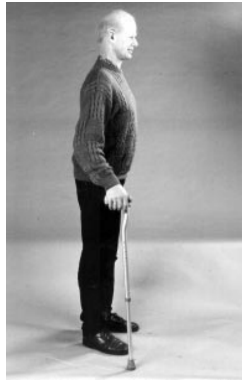
Figure 5 This 44 year old man with AMN shows a posture resulting from a slowly progressive spastic paraparesis with an onset 15 years earlier. He also shows the typical scanty scalp hair.

As many as 20% to 50% of all heterozygotes may show neurological symptoms resembling those of AMN. 16 50 The onset usually is in the fourth decade, symptoms are milder, and the progression is slower than in the patients with AMN. On cerebral MRI abnormalities in white