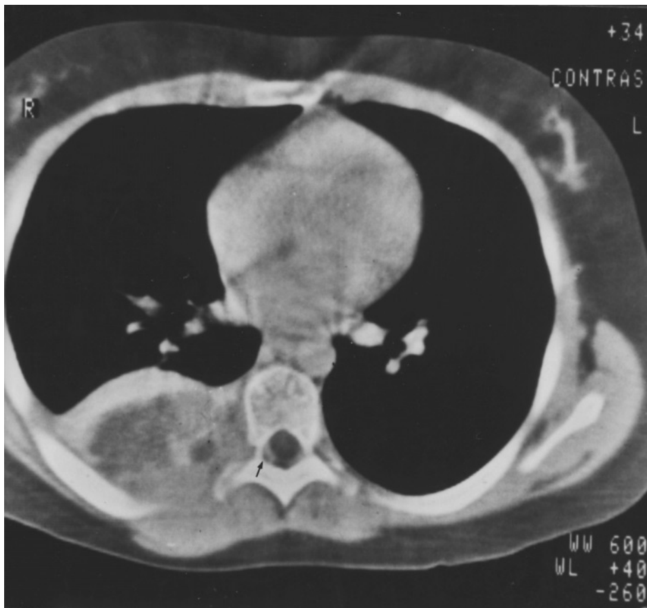
Fig. 2. CT scan of original tumour: Ewing sarcoma of right 7th rib with large soft tissue mass in the posterior thorax and early protrusion into the spinal canal (arrow).

had to be accepted; otherwise, the dose to the cord would have been too high.