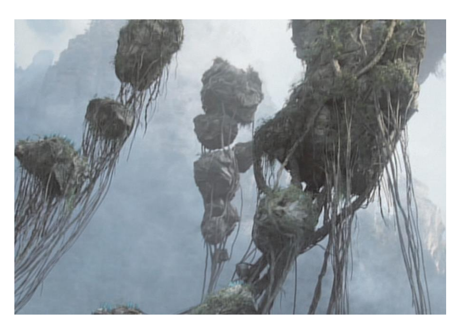
Figure 4 The floating mountains of Pandora (James Cameron, Avatar)

On an even more comprehensive bio-spiritual level, the entire biosphere of Pandora, dominated by lush and dense jungles, gradually turns out to form a giant nervous network. On this level, it is mainly the entanglement of lianas and branches, air roots, trees and climbing plants that visually produces the similarity to actual neural networks as first presented in the laboratory scene. The film here reiterates a long tradition of comparing nerve cells to trees and forests that goes back at least to the Spanish neuroscientist Ramón y Cajal (1852-1934), a pioneer of the cellular approach in neuroanatomy. Ramón y Cajal famously spoke of the cellular 'forest' of the brain and compared the cerebrum to a 'tree whose foliage spreads out'<sup>74</sup> in order to emphasize the ability of brain cells 'to respond to the environment by growing in new directions'.<sup>75</sup> This aspect also comes to the fore in Gerard Edelman's frequent use of botanical imagery, for instance when he talks about branches of axons as 'arbors', <sup>76</sup> 'dendritic trees'<sup>77</sup> or the 'aborization'<sup>78</sup> of nerve fibres. [56]