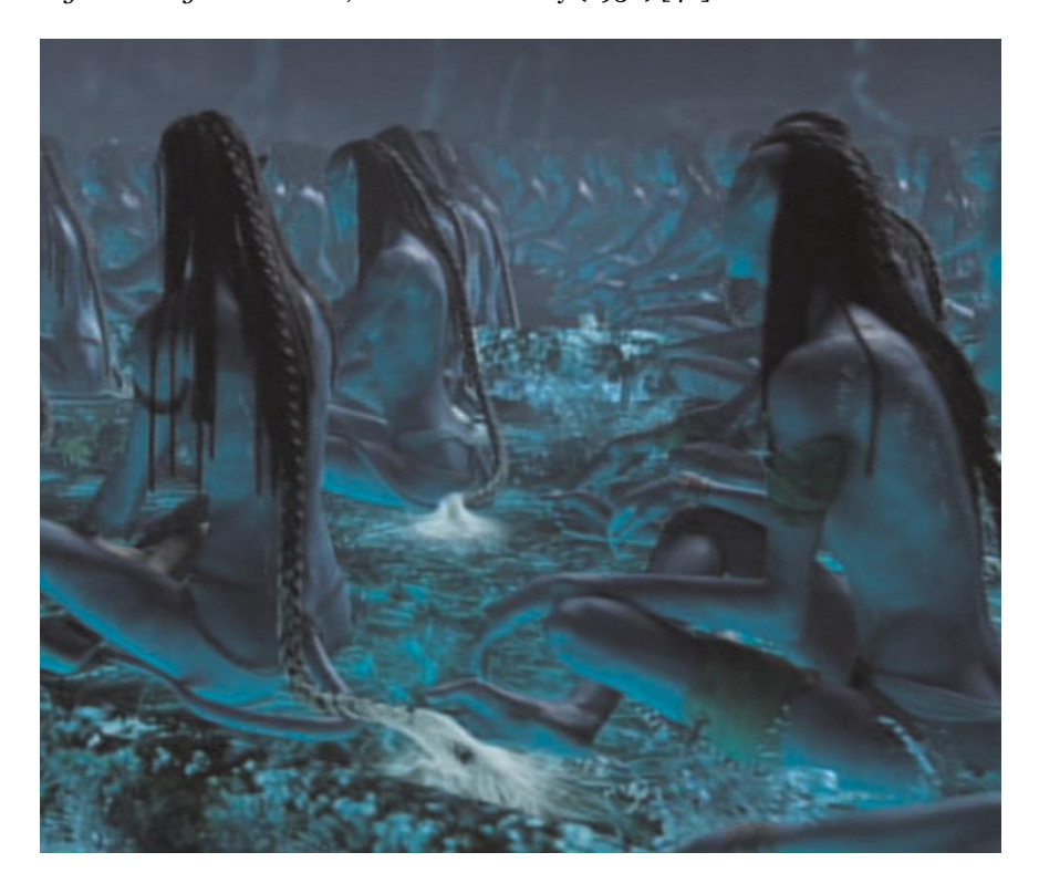
Figure 2 Gathering at the Tree of Souls (James Cameron, Avatar)