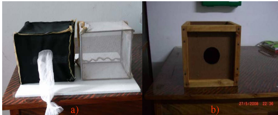
Figure 1 A photograph of a) black cloth and netting cages, b) cage made with mud-lined panels.

The fungal solution was applied to the delivery surfaces using a hand-held air compressor sprayer (Minijet®, SATA, Germany) held 50 cm away and at a right angle to the surface. About 23 ml of fungal formulation ( 2 \times 10^{10} conidia m^{-2} ) was applied onto each of the surfaces. Treated materials were left to dry for 48 h. Sections of netting and black cotton cloth were then joined using Velcro strips, to fit over 20 cm 3 wire frame cages. Mud-lined plywood panels were assembled into 20 × 20 × 20 cm cages. Mosquitoes were then exposed to the treated surfaces (Figure 1) as described in the bioassay procedures below.