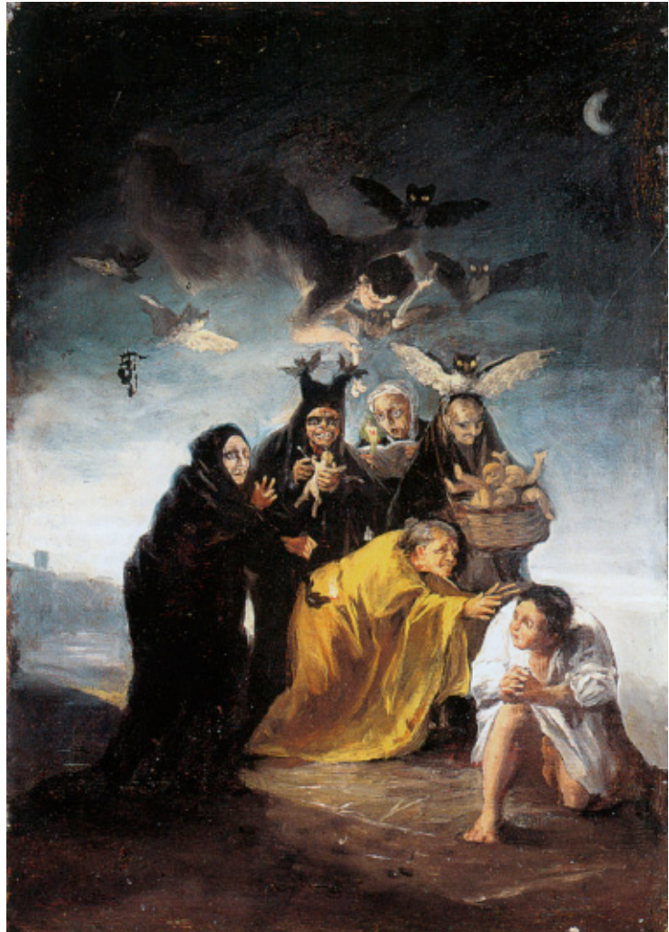
Fig. 3 Francisco Goya, The Conjuror (The Witches), 1797-1798, oil on canvas, 43 x 30 cm, Fundación Lázaro Galdiano, Madrid.