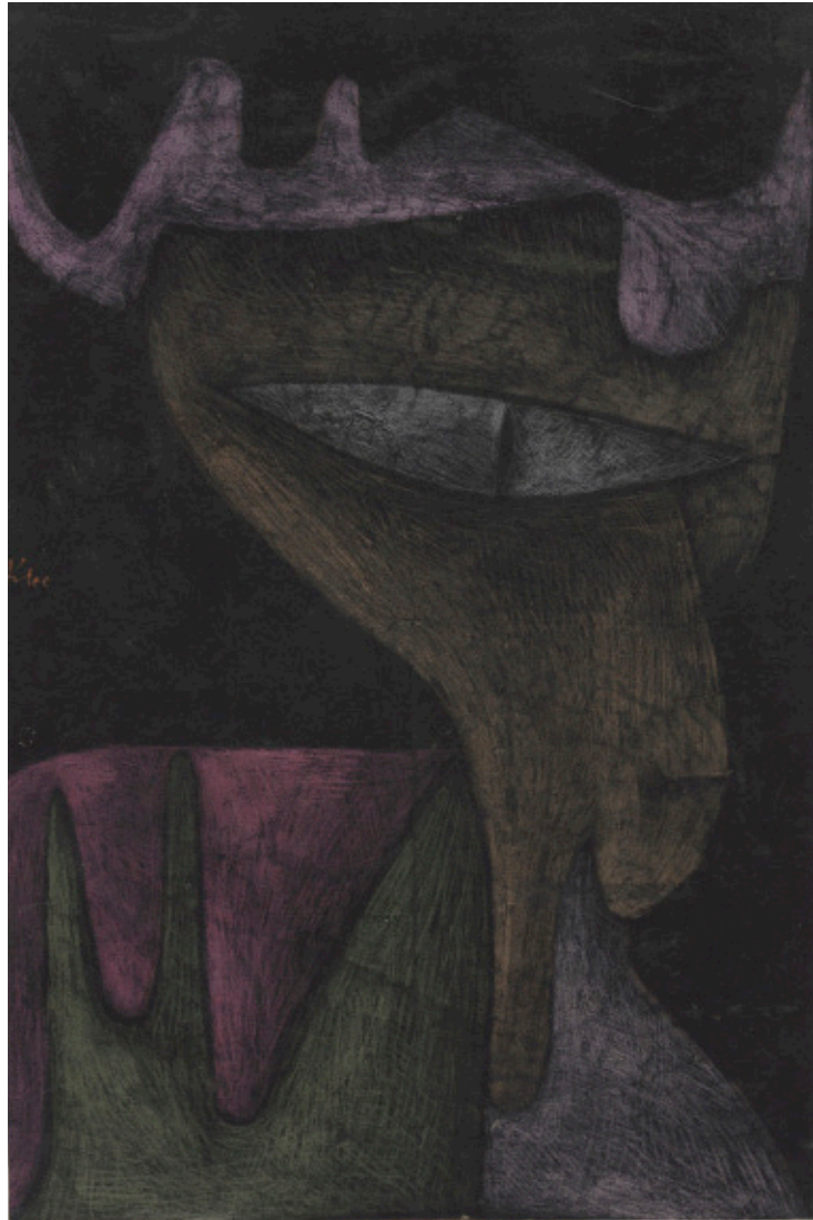
Fig. 3 Paul Klee, Demonic Young Lady , 1937, crayon and distemper on paper on carton, 45,6 x 30,9 cm, Bern, Zentrum Paul Klee.

Kandinsky and af Klint. In similar vein another usual suspect is on display, the book Thought-Forms by Theosophists Annie Besant and Charles Leadbeater and its colourful illustrations of thought-forms, but combined with something less frequently seen and just as relevant: colour-full conference designs by Rudolf Steiner explaining metamorphosis, thought-processes and the cabalistic Séphiroth. Also the early avant-gardes are not limited to the abstract ones. By also including avant-garde artists who continued to work more or less figuratively, such as Tyko Sallinen, Alberto Martini or Paul Klee, the show does point out that others also engaged in occultism just as the abstract artists did.