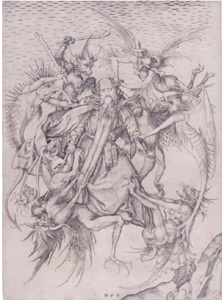
Fig. 2 Martin Schongauer, Temptation of the Saint Antony, ca. 1473, engraving, 30,7 x 27,2 cm, Strasbourg, Cabinet des Estampes et des Dessins.

good job with this exhibition. It consists of one main show and two small complementary expositions, a film and lecture program, and a catalogue which contains a wealth of illustrations and a number of good contributions. The two small shows are in the same building but separated from the main show, to which the full first floor of the Museum is given over. Entitled L'Europe des esprits, arts et littérature , it is structured chronologically and ranges from early Romanticism to the late avant-gardes. One starts off with Les Romantiques et l'occulte and continues through Symbolismes and Abstractions et autres expressions d'avant-garde to the final part, Constellations surréalistes . The focus is exclusively European and on display are mainly paintings with some drawings and sculptures included for good measure.