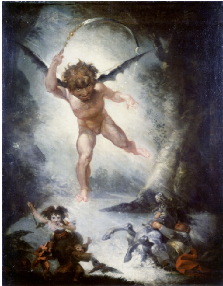
Fig. 1: Johann Heinrich Füssli, Robin Goodfellow-Puck, 1787 – 1790, oil on canvas, 106 x 82 cm, Museum zu Allerheiligen, Schaffhausen. (© Adagp Paris 2012)

Only a couple of years ago the Musée d'Art Moderne in Paris (Centre Pompidou) organised a monumental exhibition on modern art and 'the sacred', entitled Traces du Sacré . 1 It continued where a much earlier show had left off: the 1986 exhibition The Spiritual in Art (Los Angeles and The Hague). 2 Now the Musée d'Art Moderne et Contemporain de la Ville de Strasbourg (MAMCS) has trumped both with a grand exhibition focusing on the same topic: L'Europe des esprits ou la fascination de l'occulte, 1750 – 1950 . 3 Obviously where Traces du Sacré and The Spiritual in Art opted for terminology such as 'the sacred' and 'the spiritual', the curators of L'Europe des esprits have made no bones about the real topic under discussion: occultism.