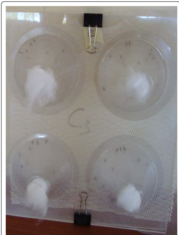
Figure 1 Photograph of the WHO cone bioassay setup. Photograph shows how the cones were suspended between two plastic sheets with holes in, with the mosquitoes directly contacting the netting. Fine mesh netting (best seen in the bottom of the photo) was used behind the treated net to prevent mosquitoes escaping.

regression analysis was carried out. Confidence intervals of the proportions were calculated using the normal approximation interval model. For the cone bioassays, the replicates were not significantly different from each other, so the data were pooled. For survival analysis, differences between the control and fungus-exposed mosquito survival rates were investigated using Cox' regression analysis. Mortality rates were given as hazard ratios (HR), which gives the average daily risk of dying relative to the control. All statistics were carried out in SPSS 17.0 [30] with \alpha at 0.05.