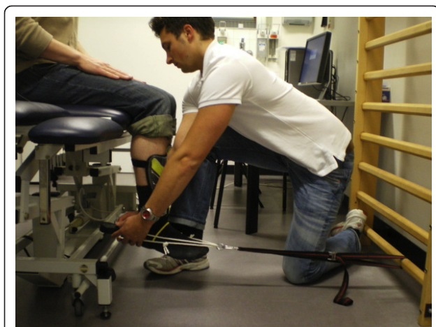
Figure 3 Clinical assessment of muscular isometric knee flexion strength using a modified hand-held dynamometer.

When analyzing this study's reliability using the SEM and SDD, high measurement error was indicated. Previous studies evaluating HHD, in contrast, have demonstrated only low to moderate measurement error in terms of SEM and SDD [14,22]. These studies, however, were performed on other populations and used non-modified HHD [14,22]. Results of the current study would, therefore, be more comparable with a study by