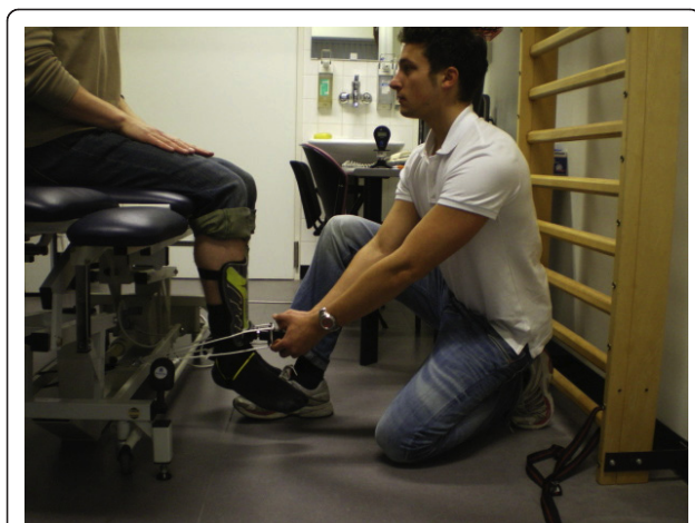
Figure 2 Clinical assessment of muscular isometric knee extension strength using a modified hand-held dynamometer.

Prior to testing, the patient was given a visual analogue scale (VAS) and was asked to place a line corresponding to the severity of pain in both the affected and unaffected knee. The corresponding number (zero representing no pain and 10 representing unbearable pain) was