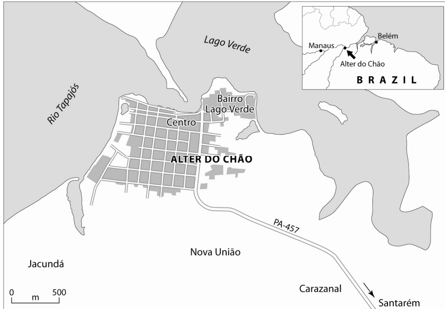
Figure 3. Map of Alter do Chão

this resulted in the formation of new neighbourhoods and the growth of the neighbouring community of Carazanal (Fig. 3). Especially those who had relatives and/or land there, but also those who could not afford to buy a small plot of land even in the poorest area of Alter do Chão, moved to Carazanal, which is growing so rapidly that it is expected to become an outskirts of Alter do Chão soon.