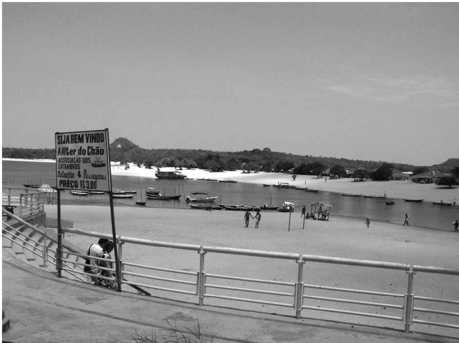
Figure 2a. Alter do Chão, Ilha do Amor (Love Island), 2008.

In Alter do Chão, the main attraction is the Ilha do Amor (Love Island) (Fig. 2a), which is connected to the village’s mainland during the dry season, but only accessible by catraias (small one-person rowing boats) operated by local people during the wet season. In addition, the village attracts thousands of visitors during