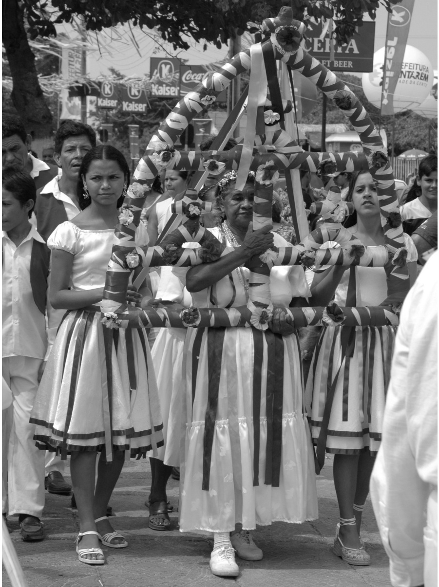
Figure 2b. Women carrying the arch of Sairé during the festival in September, 2006.