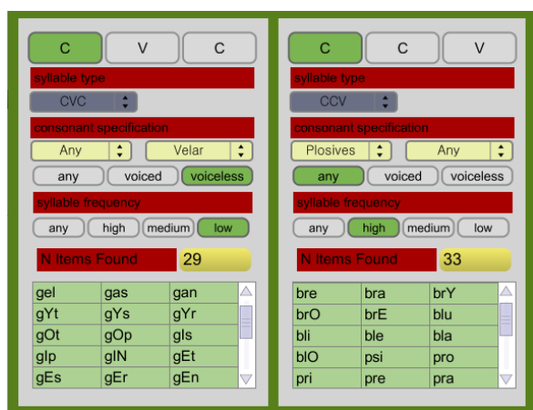
Figure 2: A snapshot of the part of the interface allowing configuration of syllable sets

The process starts with selecting the number of syllables in the current set, a number between one and four. Consequently, the selected number of 'syllable boxes' appear on the screen. Each box allows for a separate configuration of one syllable group. As can be seen in Figure 2, a syllable box contains a number of menus, and a text grid at the bottom of the box.