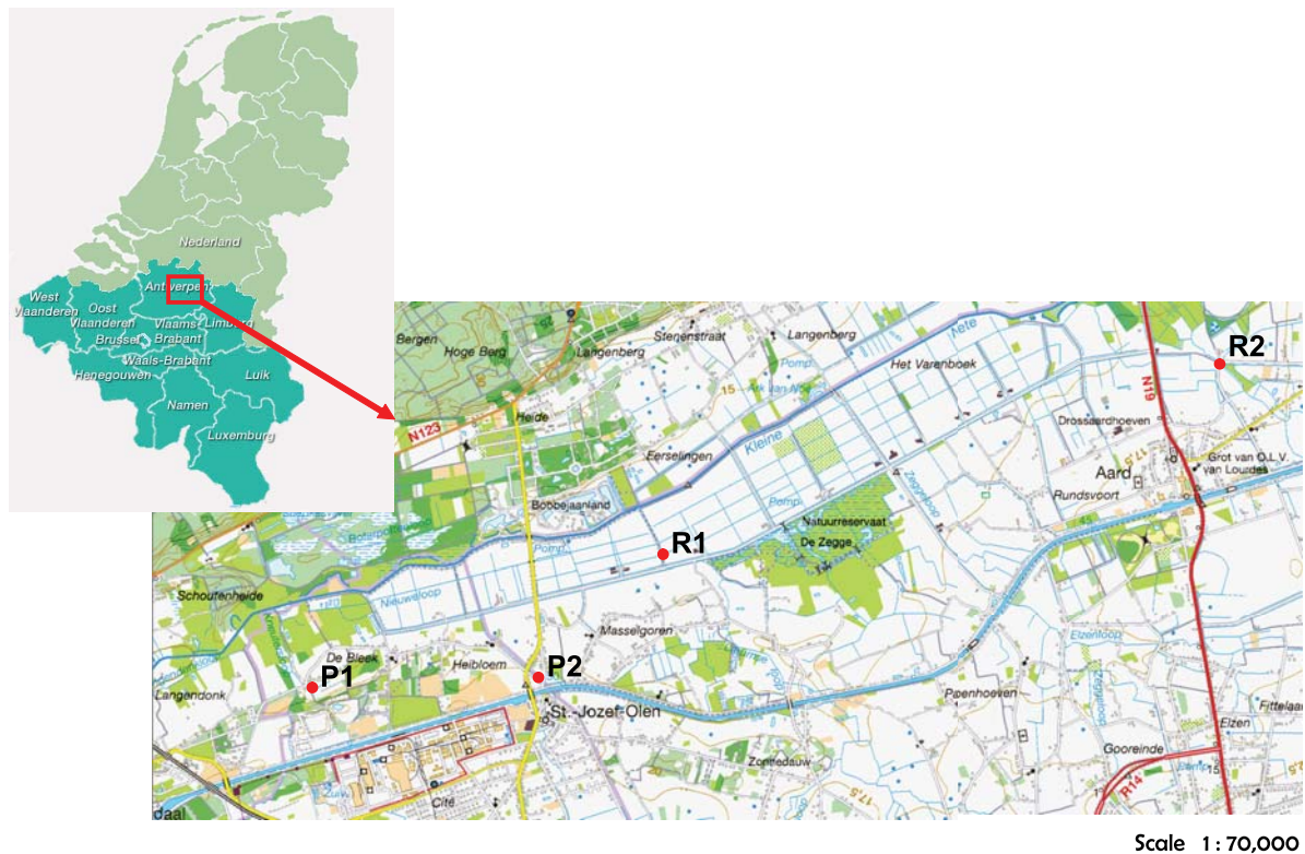
Figure 1. Sample sites in Belgium. P1: Kneutersloop (VMM code 303600), P2: Steenhovenloop (VMMcode 303800), R1: Larumseloop (VMM code 303840), R2: Dalemansloop (VMM code 303900).

mm), and midge larvae were collected. The sampled individuals were placed in buckets and transported to the laboratory on the same day. Within 24 h after sampling the individuals were selected for either microsatellite analysis or to set up a culture. Only the P2 sample contained enough individuals to set up a culture.