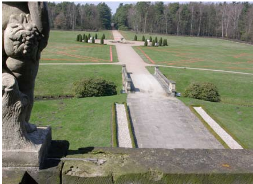
Fig. 2 Reconstructed vista of the Dutch Oranienbaum garden in Kulturstiftung Dessau-Wörlitz, Germany. (Photograph author, 2006)

To be sure, wild landscapes during the picturesque decade were no less designed at the drawing table than pre-modern Baroque gardens or postmodern heritage-scapes, as might be illustrated by the well-known engraving of Repton with his theodolite or Kippregel . We seldom see landscape gardens, however, represented by 'imperialist' bird's eye views or other imprints of power. Instead of copper engravings and oil paintings or film and photography in our period, watercolours were the usual medium for the representation of landscape gardens. This fast technique belonged to a world of picturesque tours in