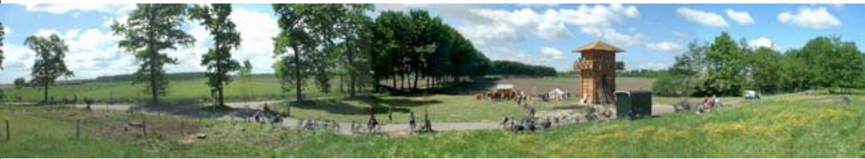
Fig. 4. Roman watchtower at Vechten, the Netherlands.

literally owned the land, modern heritage experts and landscape designers, however, lack a natural bond or attachment with their sites. While landscaping was primarily an active ideological project aimed at the material and aesthetic appropriation of 'picturesque' environments by self-proclaimed national elites (Bermingham 1994; Van der Laarse/Kuiper 2005c), heritage experts may be regarded no more than protectors of the former creations of these connoisseurs by pedigree.