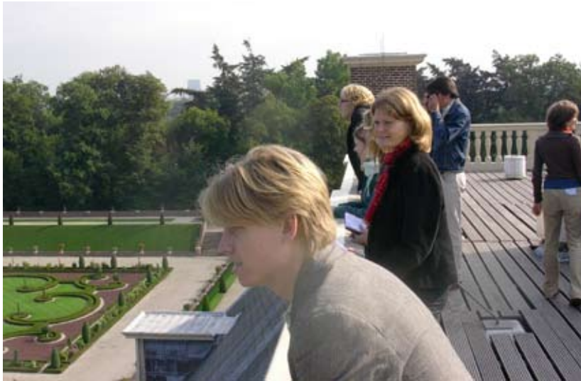
Fig. 1 Amsterdam heritage students gazing at the Netherlands' only (reconstructed) Baroque garden from the roof of the Het Loo Royal Palace near Apeldoorn.

pasts forgotten and remembered (Holtorf/Williams 2006). Second, there is probably nothing more local than a living landscape and nothing more global than European landscape identities (Agnew 1998). Provided that it is not used in a Hegelian way as a layering of stages, the metaphor of cultural biography (Samuels 1979; Kopytoff 1986; Kolen 2005) seems to me an ideal tool to deal with such contradictions. Landscapes are after all presentist constructions which use local stories and place memories for the fabrication of regional identities while applying universal meanings to stereotyped heritage-scapes such as 'the Alps', Tuscany or 'Holland'.