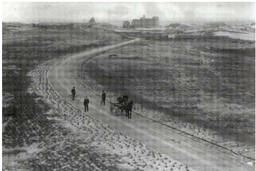
Fig. 3 Landscaping of the coastal estate of Bergen (province North Holland) with the Zeeweg designed by Leonard Springer who was commissioned by the Van Reenen family. (From Van der Laarse 2001)

Propagating the power or taste of their creators, gardens in the past were above all political landscapes (Warnke 1994). While this was obvious in the Baroque era, it also applies to the picturesque. Although our idea of landscape owes much to the sentimental taste of the landlords of this later period who