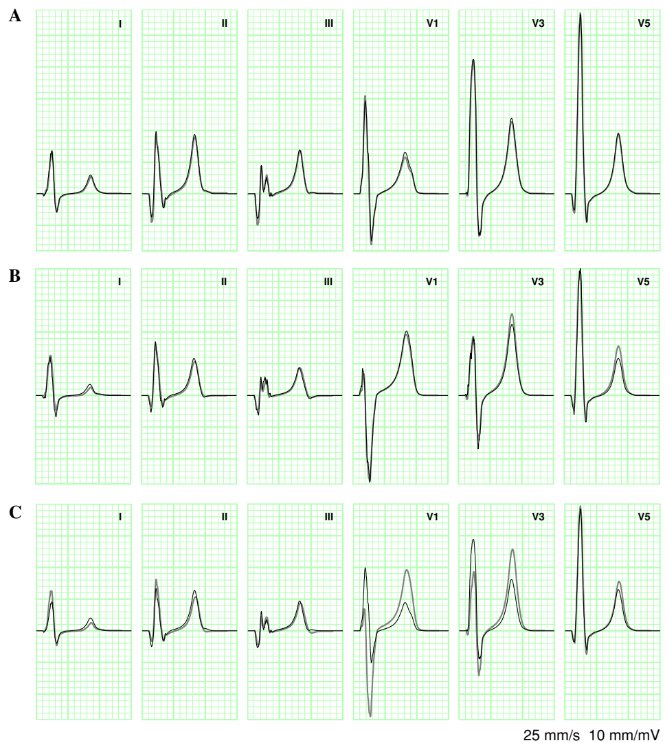
Fig. 2 Comparison of ECGs simulated with an FD model (gray) and with a BEM model (black). ECGs were obtained from a normal (sinus rhythm) activation sequence. A representative subset of the standard 12-lead ECG is shown. ECGs are displayed in the conventional way, using grid lines with 40 ms spacing horizontally and 0.1 mV spacing vertically, and no axis labels. a Both models isotropic (RD = 0.08). b Both models anisotropic (RD = 0.13, Table 3). c Fully isotropic BEM versus anisotropic FD model (RD = 0.59, Table 4)

This similarity is probably coincidental, since it only occurred for the normal set of conductivities. Moreover, the anisotropic-sphere approximation did not accurately predict f_T .