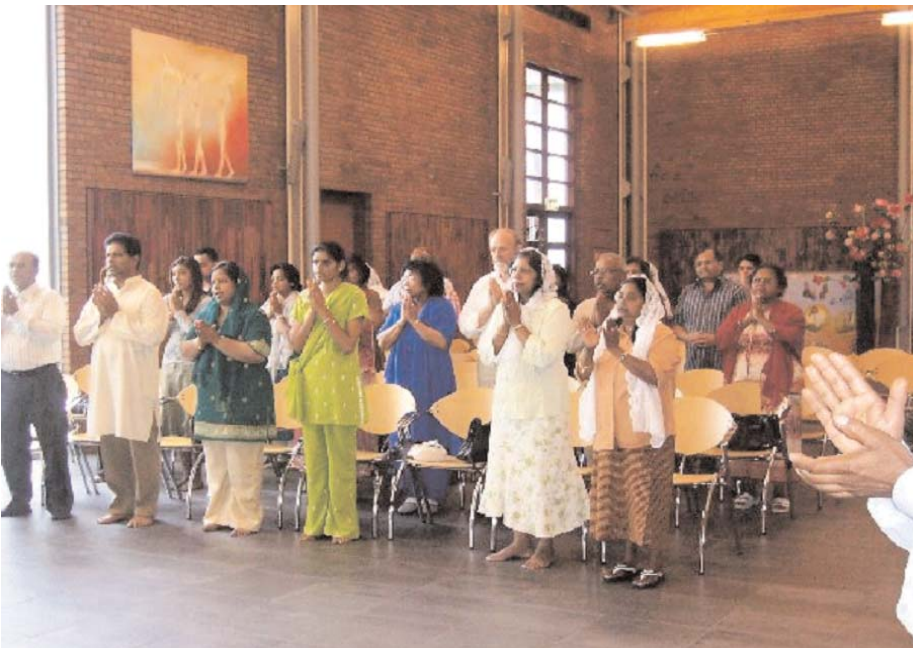
Figure 4: Hindu services of the Vishwa-Hindu Mandir in the Petrus and Paulus Kerk in Breda

The board itself is from the Sanathan Darm movement, but clearly states that their Mandir (temple) is not bound to one movement or god, such as Vishna or Shiva. In 2006, the name Aum Pracharek Sabha was replaced by Vishwa-Hindu Mandir, which means World Hindu Temple. The services of the Vishwa-Hindu Mandir in Breda were held in premises belonging to the Jerusalem Parish – the Catholic Parish for Central Breda – up until 2007 in the St. Michaelskerk and more recently in the Petrus and Paulus Kerk.