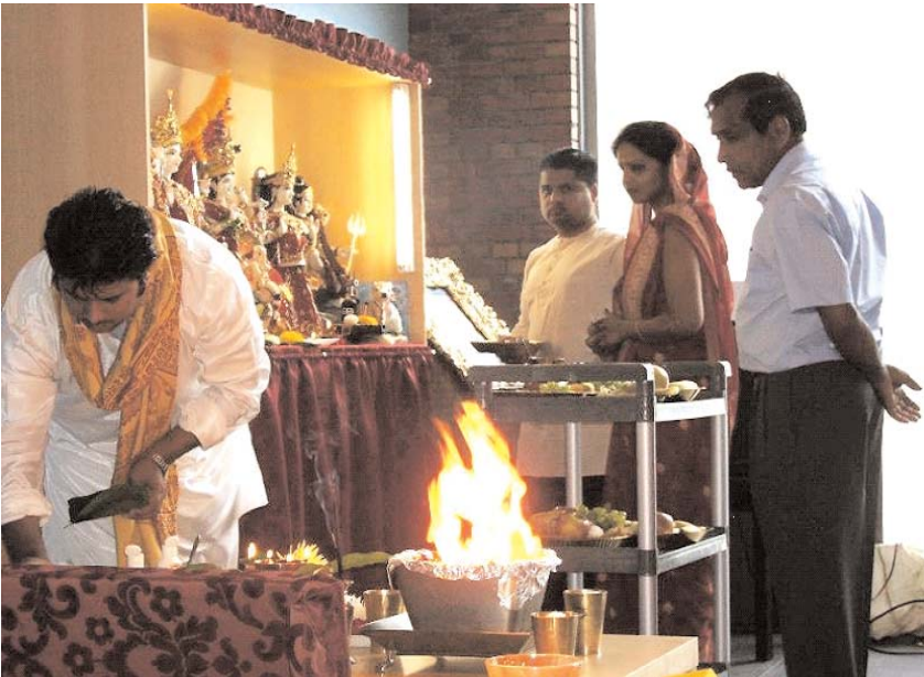
Figure 3: Hindu services of the Vishwa-Hindu Mandir in the Petrus and Paulus Kerk in Breda