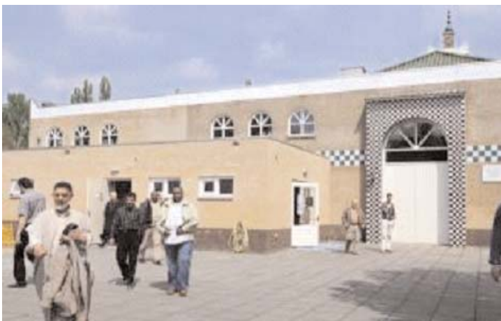
Figure 5: Front view of the Ar-Rahman Mosque in Breda

Finally, after a very long process, the building plan was approved. The next phase involved getting a building contractor. This was a faster and more successful process. A contractor with a good reputation was found who was available to commence work immediately and who agreed to do the work for a low price. When the building started, many Muslim men assisted with technical aspects of the work. In practice, the mosque was built by these members of the community, which was a very positive experience for them. Many men joined in enthusiastically, each offering their own expertise: one did the stucco work (ornamental interior plaster work), another did the tiling and a third person installed the electrical system. In the end, everyone was happy. There was even money left over. Immediately, a larger space was built for Muslim women.