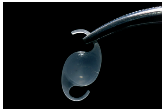
Figure 2 Explanted opacified Aquasense intraocular lens.

Visual acuity in patients with opacified IOLs can remain surprisingly good, despite severe complaints of reduced quality of vision. 6 10 Symptoms and subjective complaints correlate well with the severity of IOL opacity seen at the slit lamp and less well with visual acuity. 6 In the absence of straylight measurement, visual deterioration mostly corresponds to decreased contrast sensitivity or haziness of vision, and less with visual acuity. 2 6 10 These findings can be explained by the present