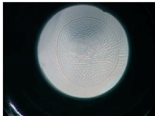
Figure 3 Diffuse opacification of one of the explanted implants with a wrinkled anterior surface and an imprint of the capsulorhexis on the anterior surface of the intraocular lens optic.