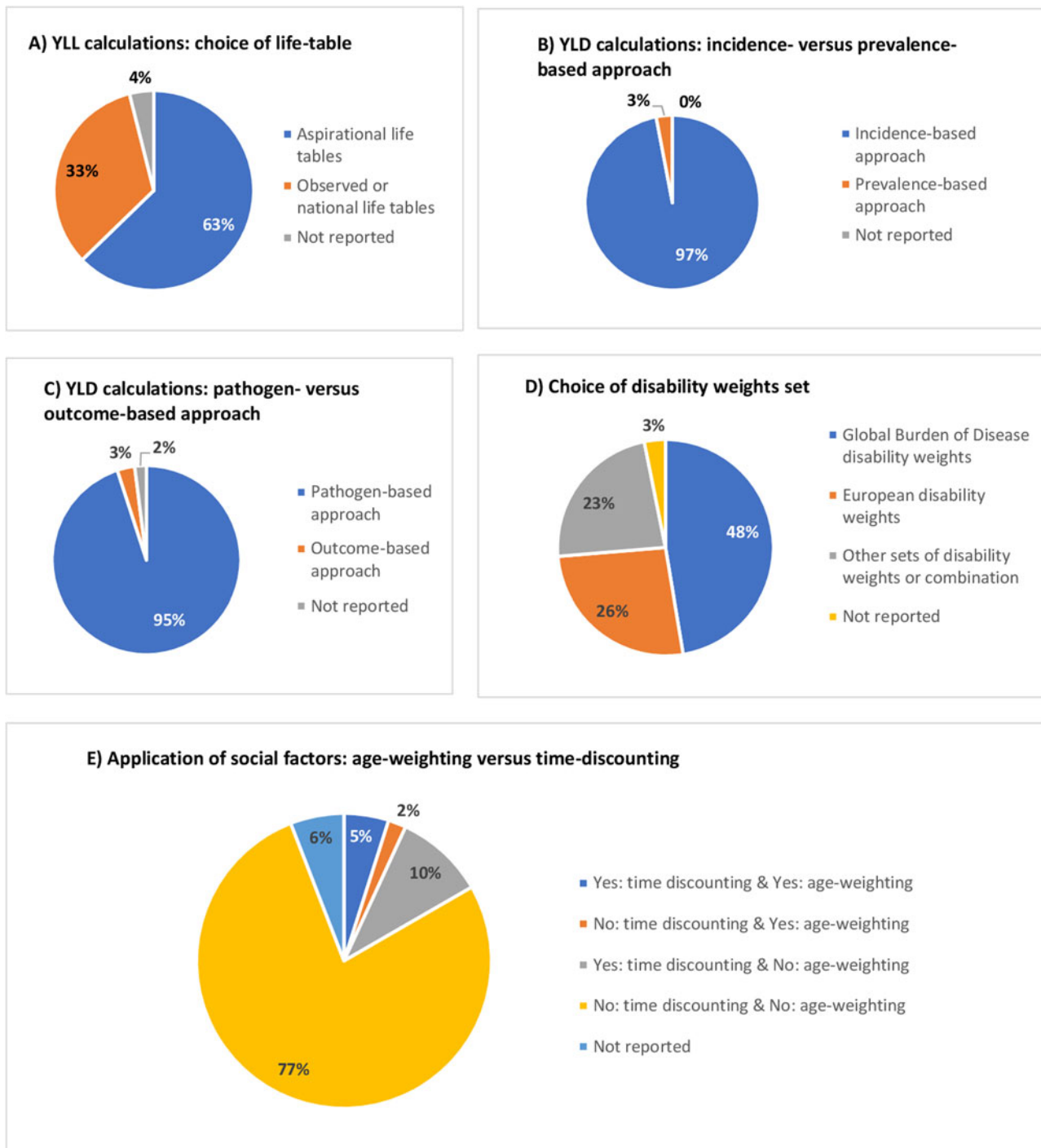
Fig. 3. Methodological approaches used to estimate YLL and YLD in independent burden of infectious disease studies, 2000–2022*. *Proportions for burden of infectious disease studies that included years of life lost calculations were reported for 102 out of 105 studies, while for those included years lived with disability were reported for 95 out of 105 studies.

estimation or over-estimation of the burden of a certain infectious disease. Each methodological choice has an impact on the resulting DALY estimation and by choosing a uniform methodology (e.g. disability weights, life expectancy) or epidemiological model (e.g. disease model, severity level distribution), these choices may not reflect the disease agent or study population, and as a result the DALY estimates will not reflect the true burden of disease.