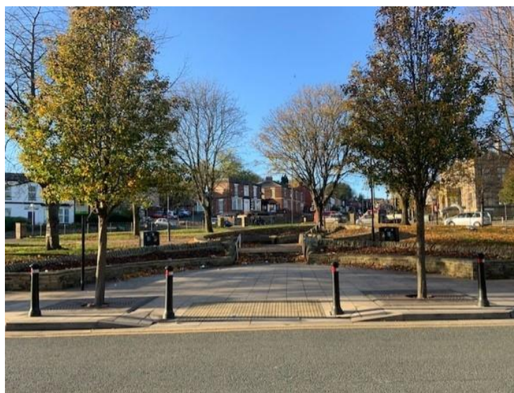
Figure 2. The Ellesmere Green © Authors (2021).

Burngreave is one of the most deprived areas in Sheffield, where Muslims are at their highest presence in the city, with over 60% of the population in the area being Muslims, originating from various countries (2021 Census). Between 2004 and 2007, there was a proposal to improve Ellesmere Green (green space and its surroundings at the heart of the area) in parallel with the Burngreave New Deal for Communities that aimed to enhance the appearance of the area and aspired to promote a stronger community (BNDfC website). The project consisted of improving the central green space and renovating the shops' frontages, and after an extended consultation process, the project was finally completed in 2013 (See Figure 2).