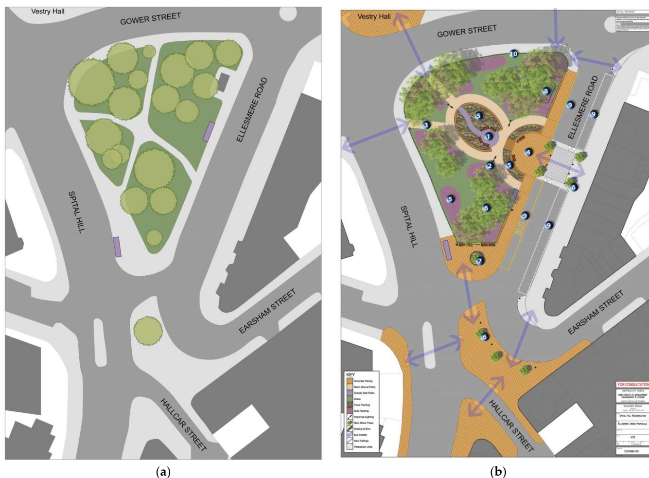
Figure 3. (a) The Old Ellesmere Green (2012). (b) The Current Ellesmere Green.

“We printed 1000s of leaflets and invited people to come along. They were dropping in the café. All the community organisations that represented anybody in the area were invited ““We talked to local members. We talked to the local key stakeholders in order to organise our thoughts in terms of Ellesmere Green . . . .” “We did 1000s of leaflets about this fun day in 2012. Come and give your views about what you want to do, and organise a lot of activities; I also organised the public meetings . . . .” (The development officer at the time of the project)