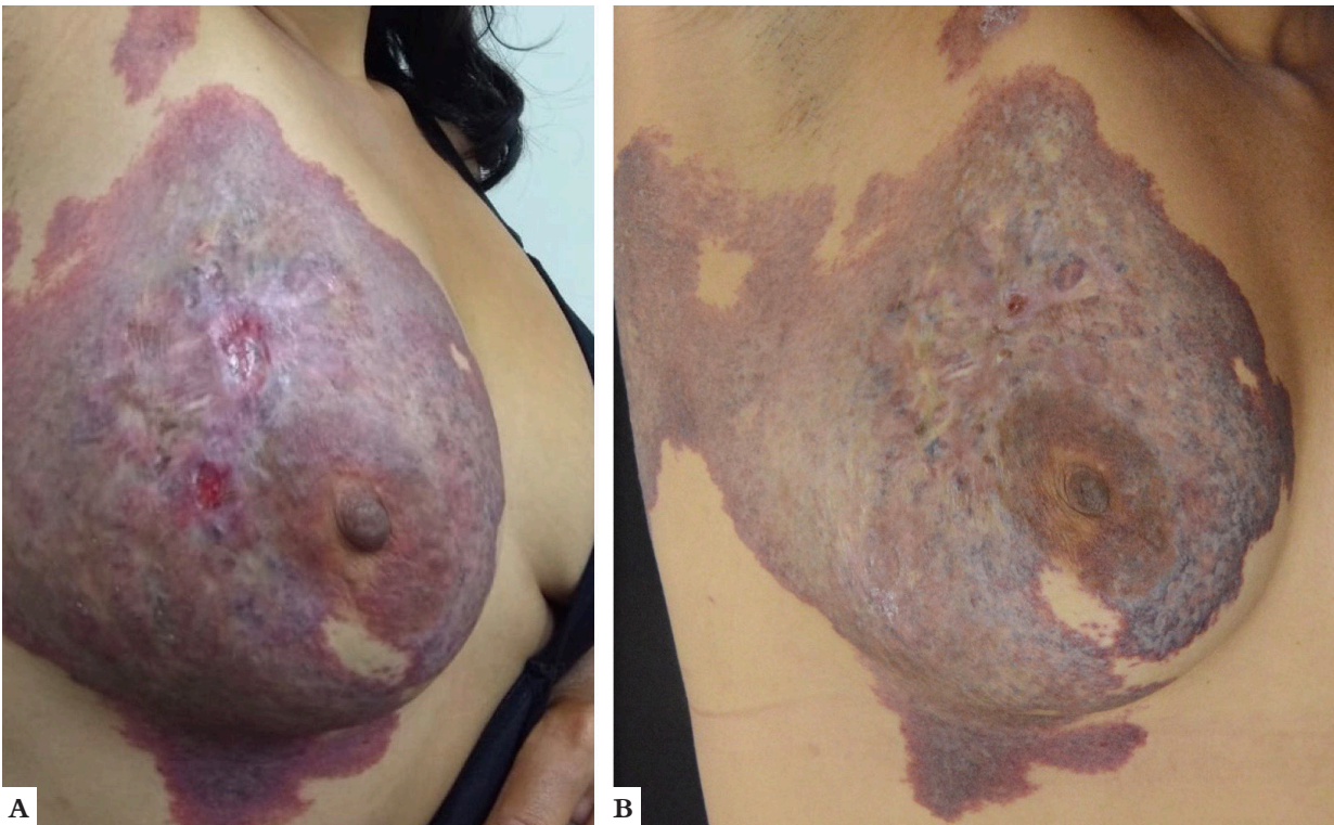
FIGURE 3: A - Patient 7, woman, 27 years old, with extensive hemangioma in the right breast region, with ulcerations and atrophic scars. B - Color homogenization and thickness reduction after treatment