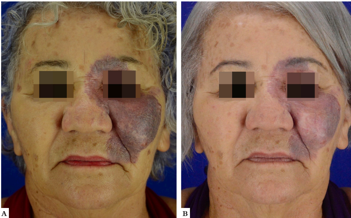
FIGURE 5: A - Patient 9, woman, 69 years old, with hemangioma on the left hemiface. B - Post-procedure with combined therapy presenting tone improvement and thickness reduction