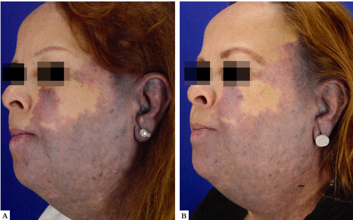
FIGURE 4: A - Patient 8, woman, 50 years old, with large hemangioma in the left hemiface and left lateral cervical. B - Texture attenuation and a slight improvement in tonality after nine sessions