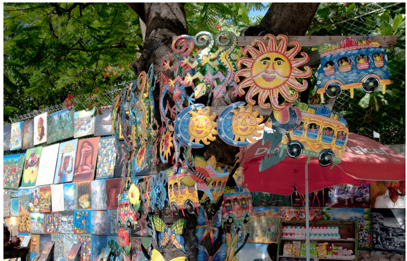
Haitian vendors art display on mountain wall