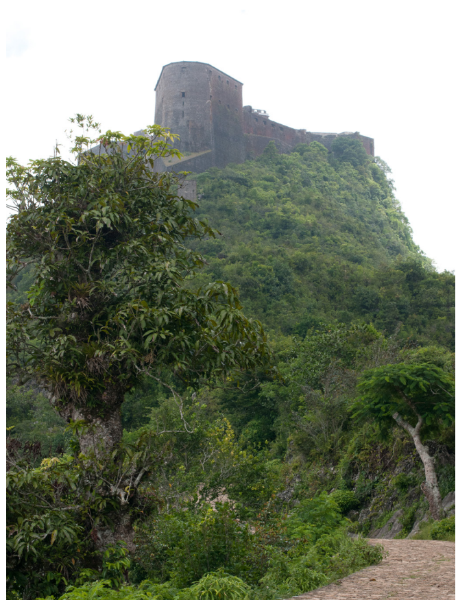
The Citadel from the road up

shrewd saleswoman, stood out. When we wanted to make a donation only, she would not accept it. She lowered the price that made it impossible to refuse her and then threw in extra items to show her appreciation. She had made very little money from the sale, but she had established a relationship with us during that brief encounter that earned our highest respect.