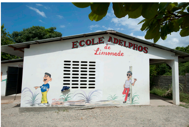
A new church school in Limonad

certainly urban, there is much less traffic. The community only felt the tremors of the earthquake, so the area has not had to undergo massive reconstruction. Here the markets seemed even bigger, more central to the economy. They are spread over main streets and small village roads. Given our interest in education, we ate dinner with a young pastor and his wife, who have built an Apostolic school that serves the lower and upper grades. They are missionaries in Limonad, and they are committed to the work of education and religion, for the two go hand in hand for them.