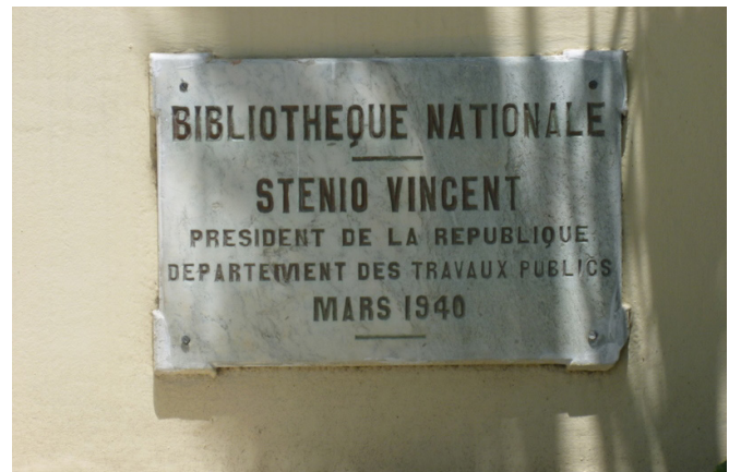
Haiti's National Library was founded in 1940

The BNH has several current international collaborations, in particular with the Bibliothèque Nationale de France, which is scanning and making digital versions of its Haitian materials available. The library is also participating in a distance-learning program for librarians with the Bibliothèque Nationale de France, the Association of French Librarians, and libraries in Martinique and Guadeloupe.