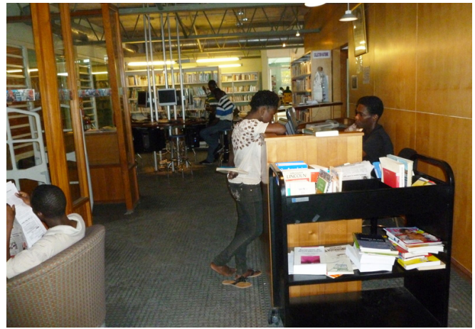
Monique Calixte Library at FOKAL

Created in 1995, FOKAL is an independent foundation in Port-au-Prince supported by George Soros's Open Society Foundations, the European Union, and other sources of funding. A well-recognized national organization in Haiti, FOKAL is active in a range of educational, cultural, and development activities in local communities. FOKAL's three strategic areas of activity are: reconstruction/environment, youth arts and education, and—of particular interest to library initiatives—access to information. In addition, FOKAL provides grant funding to specific initiatives from civil society, the artistic community, and the agricultural sector.