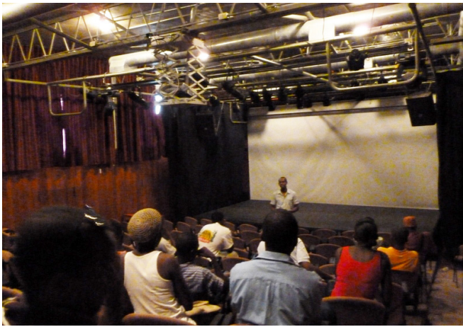
FOKAL cultural center