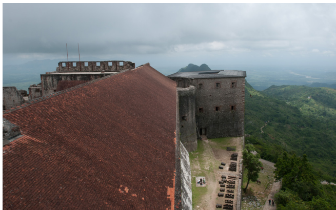
The Citadel from the upper level