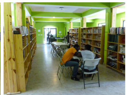
Mirbale Municipal Library