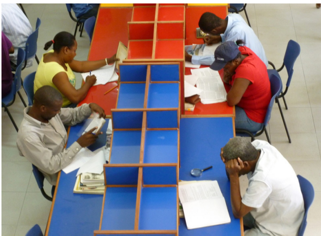
Reading room at the National Library of Haiti