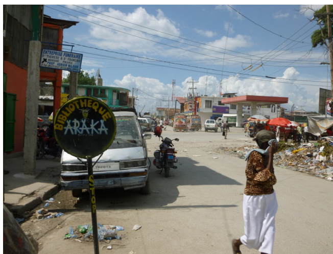
ARAKA library and cultural center

works, novels, and basic science books. These materials are primarily in French and were obtained largely from donations and other sources, including FOKAL. Located in an area hit hard by the earthquake, the building and library materials suffered significant damage, including all computer equipment. They are in need of building repairs,