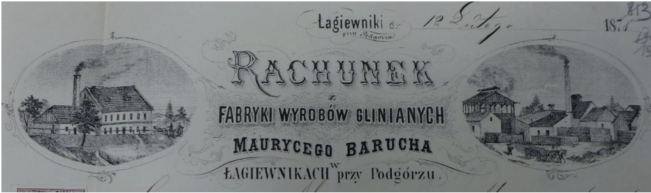
Figure 4: Brickyard in Łagiewniki, label from 1870. ANK ABM 1383/199.

The brickyard and tilery also had their own label. Unlike the mills, they were situated in the countryside. Apart from the chimneys symbolizing the business's mechanization, we also find a brick drying shed (right) as well as horse carriages suggesting a booming trade.