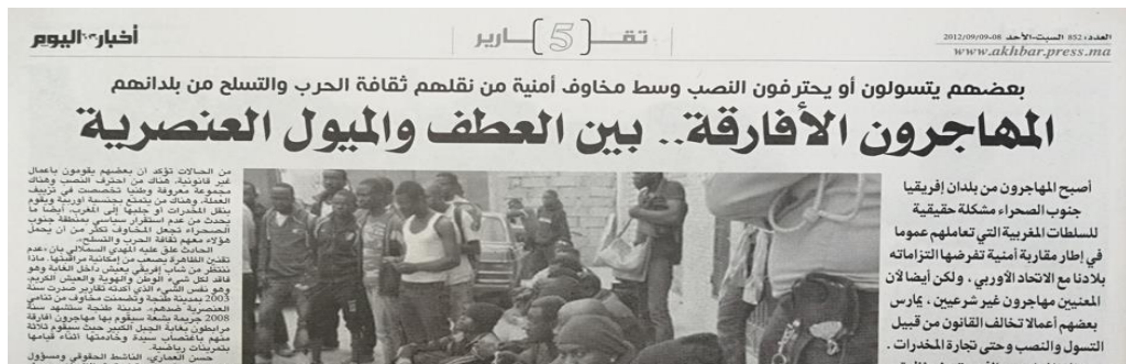
Figure 4. African immigrants ... between sympathy and racist tendencies ( Akhbar Alyaoum , Sep 8 and 9 th , 2012, N 852)