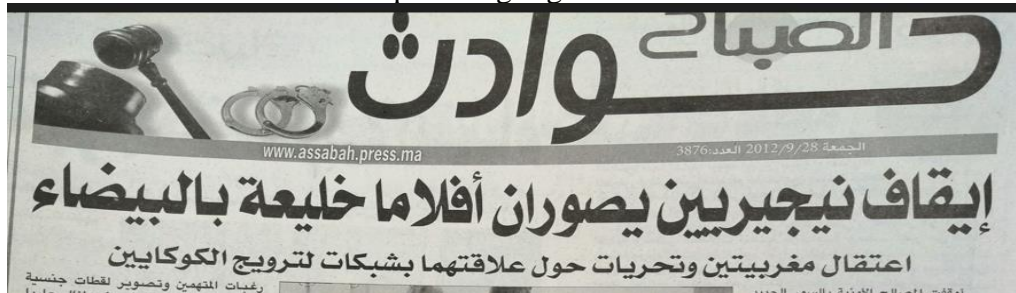
Figure 3. Suspension of Nigerians filming pornographic films in Casablanca ( Assabah , Sep 28 th , 2012, N 3876)

The following samples are chosen to give an idea to the reader about the style of headlines and the lexical choice used to depict 'African immigrants'. These samples can also give a vision of the classification of headlines the researcher attempts to highlight.