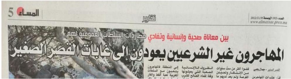
Figure 5. Illegal immigrants return to the forests of Ksar Esghir ( Almassae . Nov 30 th , 2012. N 1923)

The following headlines are examples taken from the newspaper before the migration reform. The purpose of choosing some headlines is to investigate the salient role of the lexical choice in the headlines. According to Van Dijk's schemata, Headlines have been given a variety of roles as an introduction to their pertinent primary text. It has been said that headlines and leads are the categories that make up "an initial summary" of news reports. (Van Dijk, 2013, 53)