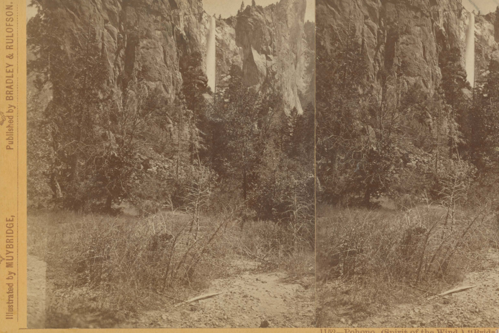
1152-Pohono, (Spirit of the Wind,) "Bridar Veil," 930 feet fall.