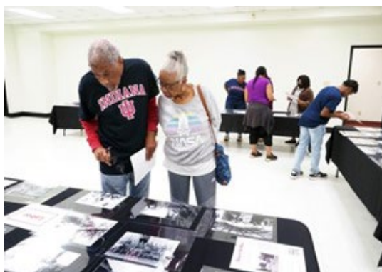
Visitors view the Down the Bay photos at our October 29 event at the Texas Street Recreation Center.