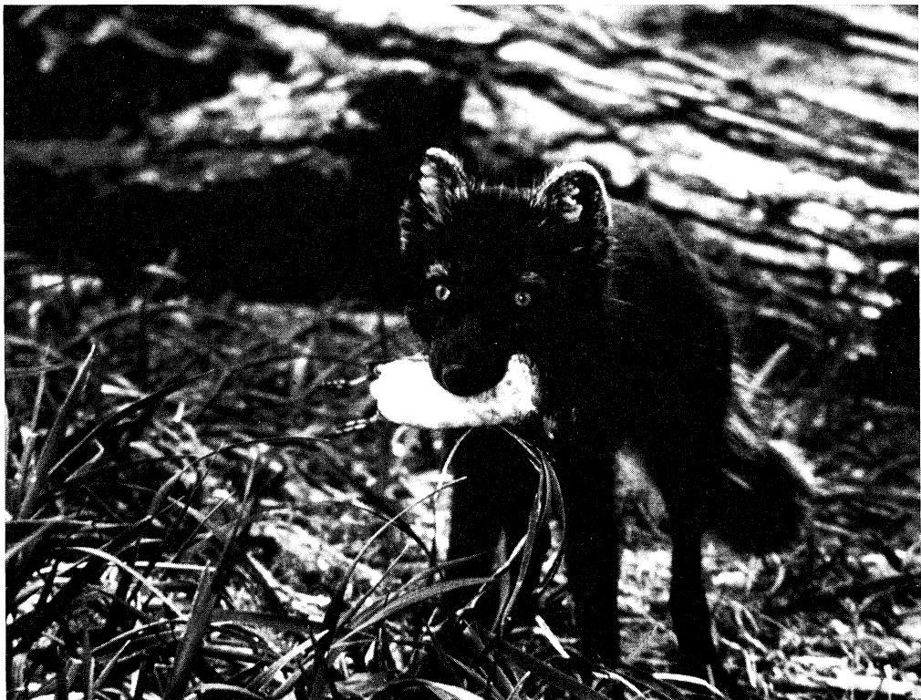
FIGURE 2 Arctic fox ( Alopex lagopus )

Former attempts by the United States Fish and Wildlife Service to reduce the impact of fox predation on the Aleutians