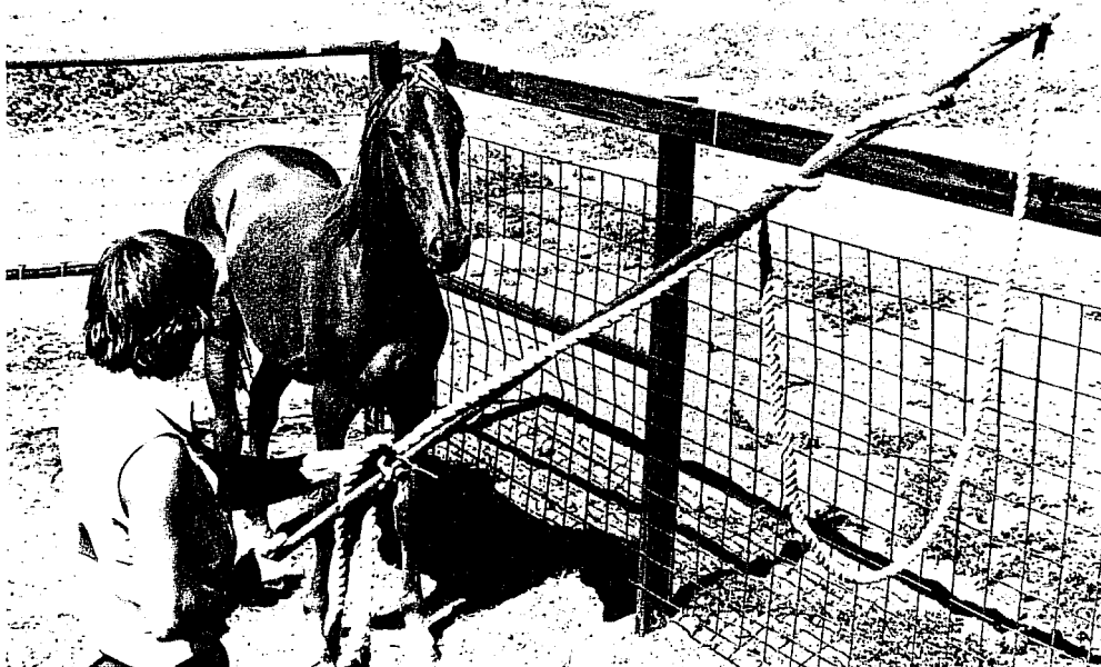
FIGURE 1 Catching: rope loop on a long stick.

right and left by stepping quickly to the right and left in front of the horse, as the rope is eased.