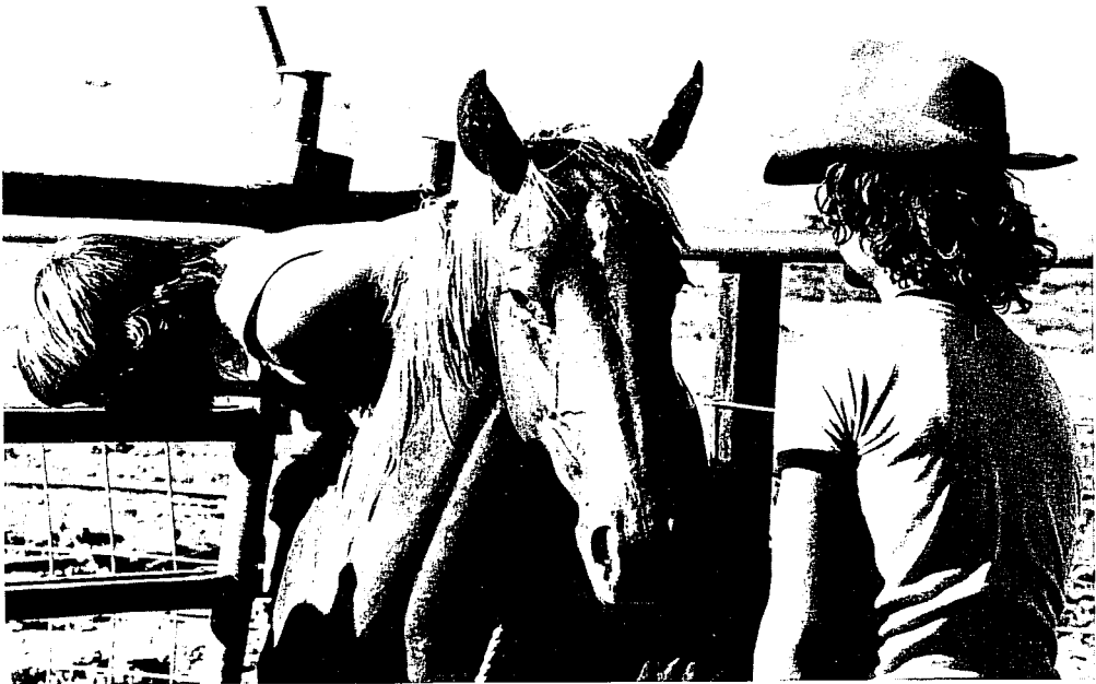
FIGURE 4 Applying body weight to prepare the horse for mounting.

the horse to instill confidence, this new procedure can be thought of as simply a matter of unbalancing the horse by using a slight pull to one side to induce the horse to advance. Further kindness is the best reward for proper performance of this "leading up."