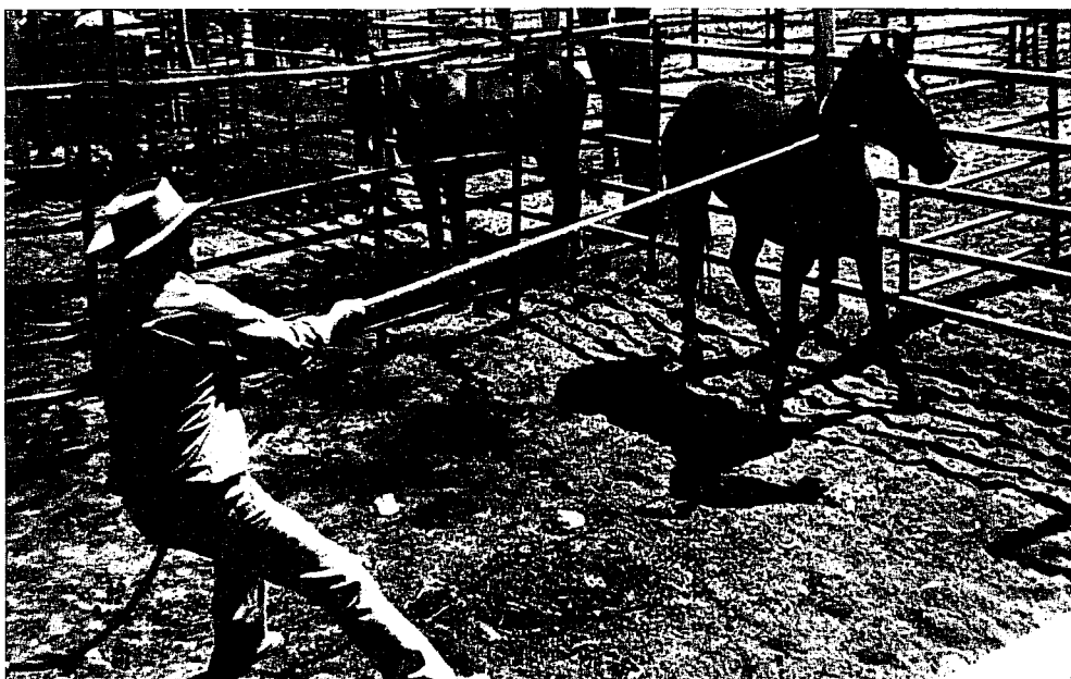
FIGURE 3 Lunging: handler (Des Kirk) at right angles to the horse's front legs.

that using a coacher horse facilitated the whole breaking-in process.