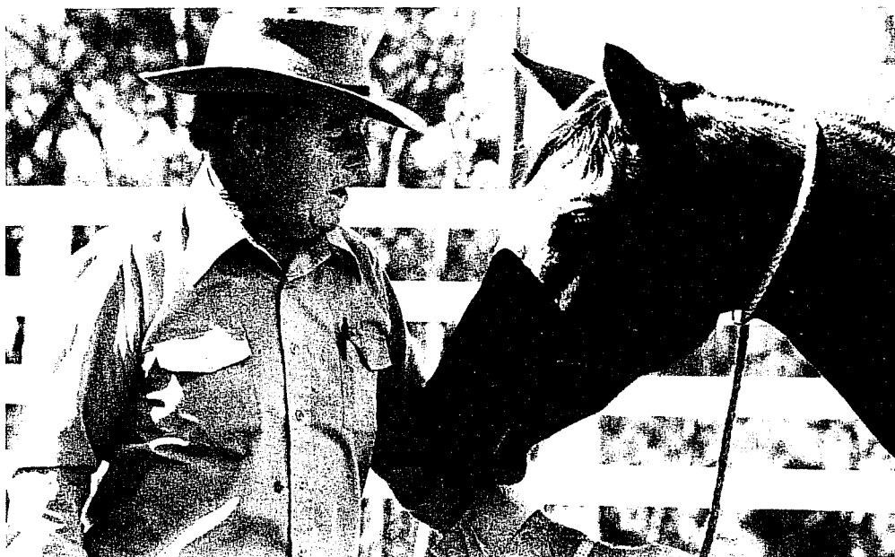
FIGURE 2 Catching rope, which is a free-running line drawn through a ring.

gradual process of advance and retreat, while talking gently to the horse, will finally allow the handler to come close to the animal.