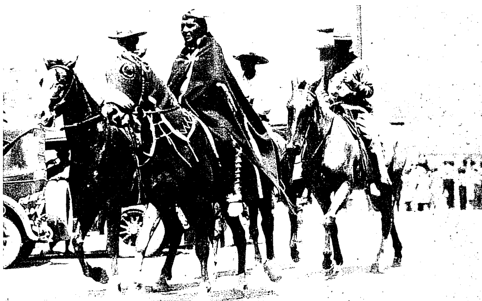
FIGURE 6 A horse tamed in 1 hour by the Indian blanket act is featured in this photograph of a 1922 parade at O'Kanogan, WA. Note how the horse's ears are riveted on the Indian Horse Medicine Man. Outriders are used as extra insurance against an accident, although the Medicine Man insisted that they were not necessary.