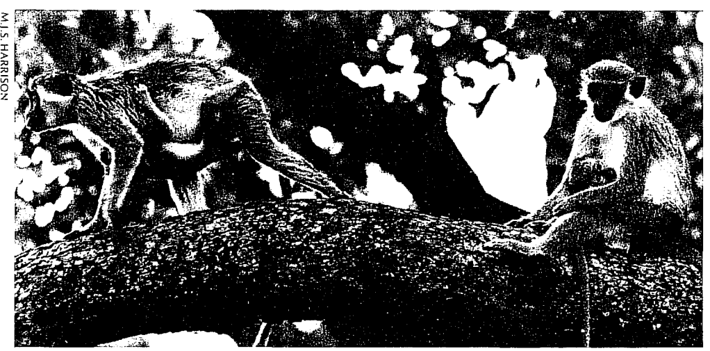
Figure 3 Two adult female green monkeys (Cercopithecus sabaeus) with their infants.