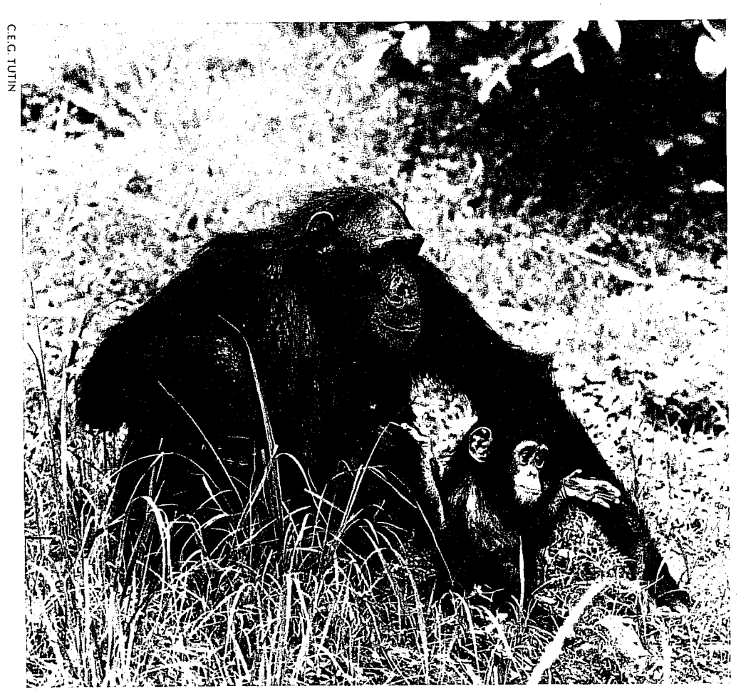
Figure 4 A young chimpanzee maintains contact with his mother as he begins to turn his attention to the rest of the world.

Primates breed selectively. Recent field studies show that no species of primate whose reproductive behavior has been studied breeds randomly. Early accounts of promiscuity lacked long-term data on identifiable individuals, or confused some aspects of sexual behavior with reproduction, i.e., with fertilization. Such selectivity in breeding is based ultimately on sexual selection as expressed in competition among males over females (intrasexual selection) and in female choice of mates exercised on the basis of this competition (intersexual selection). The evolutionary aspects of this are now well understood, being based on sex differences in parental investment and the breeding strategies which follow from this (Trivers, 1972). For example, recent findings show that in wild chimpanzees, a supposedly promiscuous species, although the vast majority of copulations are opportunistic, most of the conceptions occur during consortships (Tutin, 1979). These are temporary, monogamous bondings which require mutal consent. In some polygynous species, competition between males may take the extreme form of one male killing the infants fathered by another (Hrdy, 1979). Even in species with great sexual dimorphism in body size, such as baboons, in which males may seem to dominate social affairs, it is the females who determine their impregnators (Collins, in prep.).