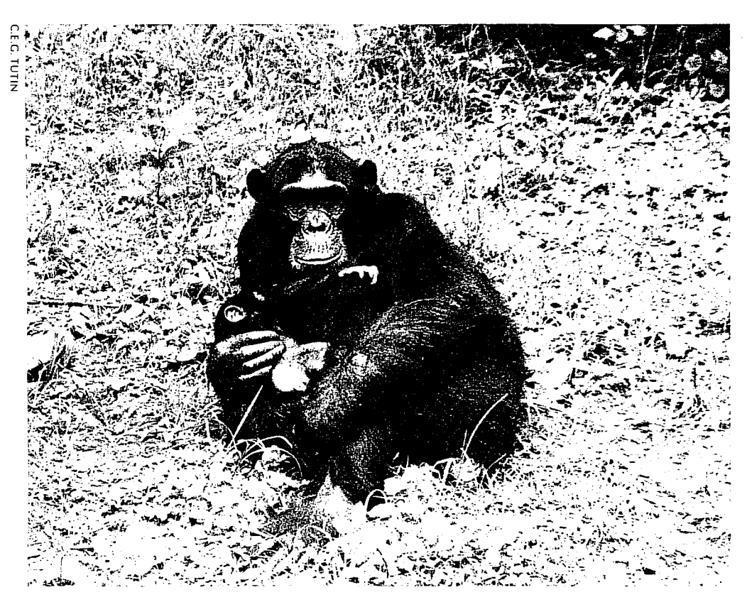
Figure 2 A young chimpanzee cradles her first-born infant as she suckles.

records show that females who did not experience maternal rearing in their infancies make poor mothers, if they can be impregnated at all. In orangutans the two effects combine to produce a virtual absence of births from second-generation, captiveborn parents, whereas wild-born individuals are successful in captivity (Jones, 1977).