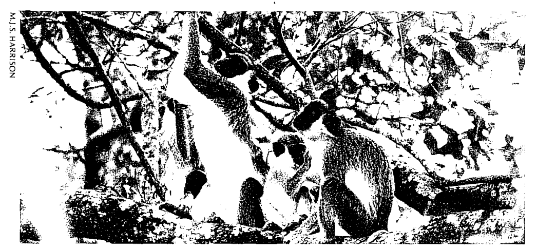
Figure 5 Two adult green monkeys are groomed by their offspring.

These observations have numerous implications for primates in captivity. For a male living in a pair with a female, or in a harem-group with two or more females, the spur of male competition is missing. This is especially important for species whose mating strategies evolved in multi-female, multi-male troops, e.g., all macaques, most baboons, and chimpanzees. The result may be progressively lower motivation to breed. Such forms should be housed in facilities of adequate size to hold two or more males. Similarly, females living in such captive conditions are prevented from exercising their choice of the fittest males, and their mental and emotional health may decline, along with their motivation to breed. Lack of choice may lead to forced matings. Chimpanzees paired in captivity mate throughout the menstrual cycle, whereas wild chimpanzees confine their matings to periods of female estrus (Tutin, 1980). Such matings result from male intimidation, and primiparous chimpanzees in captivity conceive earlier than their wild counterparts and show high rates of infant mortality (Tutin, 1980). Institutions seeking successful breeding of primates are advised to mimic as closely as possible the natural conditions under which the two sexes play out their mating strategies.