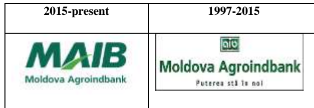
Figure 1 BC Moldova "Agroindbank" logo

In 1997, the bank registered its first official logo with the State Intellectual Property Agency, which represented it for almost 17 years, until its 2015 rebranding.