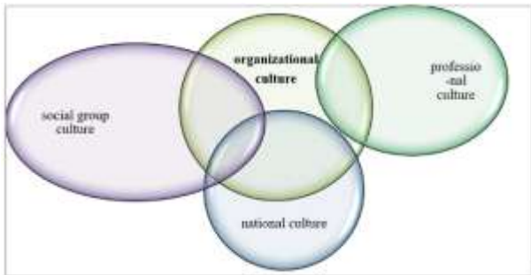
Figure 2 Model of organizational culture in Moldova Agroindbank

The cultural proximity consists, on the contrary, in recognizing the partial overlap of the places of affiliation, the organization being one of these places. It combines the influence of cultures wider than national culture and those that manifest and articulate within or professional culture and social group culture.