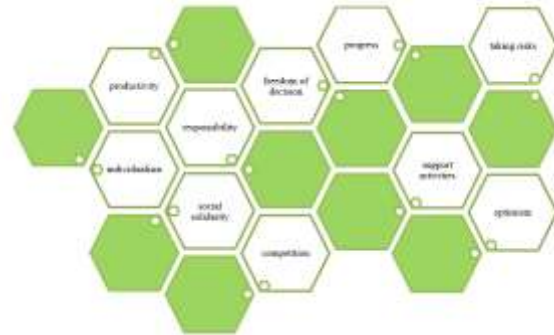
Figure 3 The values of the overall organizational culture of JSC Moldova Agroindbank

The typologies of organizational culture are also valid for business culture. In addition to the classification of organizational cultures presented in the first chapter, business culture can also be structured in relation to the territorial organization of the business. Thus, the business culture at SA Moldova Agroindbank can be: