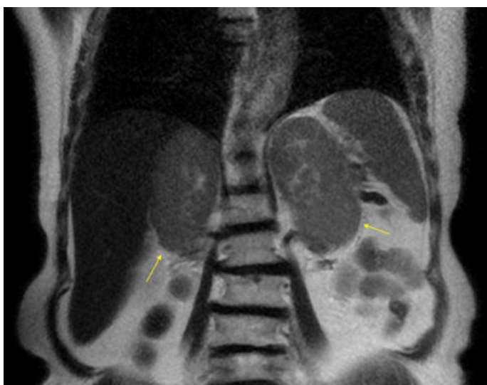
Fig. 2. Coronal T2-weighted images, hyperintense mass lesions of uniform character with smooth borders are observed in bilateral adrenal glands.