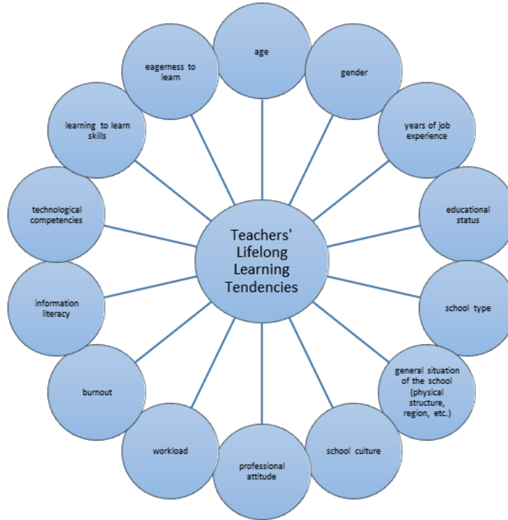
Figure 2. Teachers' LLL tendencies related elements

and skills they need in relation to information literacy competencies during their pre-service training, in other words, in teachers training institutions.