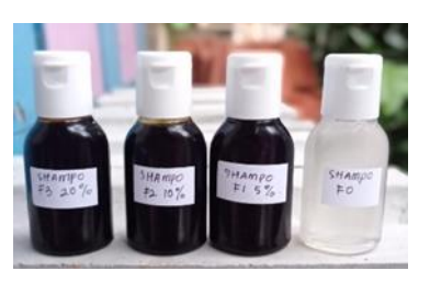
Figure 1: Shampoo preparations

The preparation consists of 4 formulations with different concentration variations, namely F1 5%, F2 10% and F3 20% and F0 without the addition of extract from simpur leaves. The shampoo preparations were then subjected to preparation evaluation tests which included organoleptic tests, homogeneity tests, pH measurements, viscosity tests, foam height tests and hedonic tests.