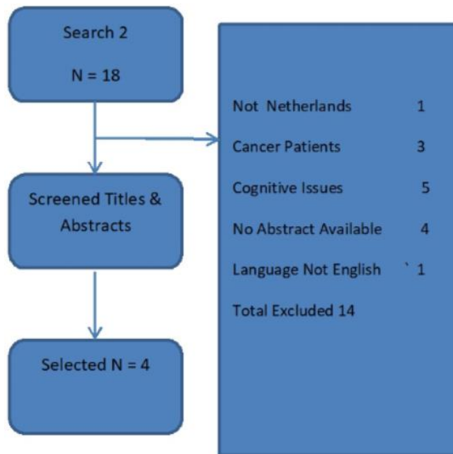
Figure 2. Flow chart of the Netherlands Studies