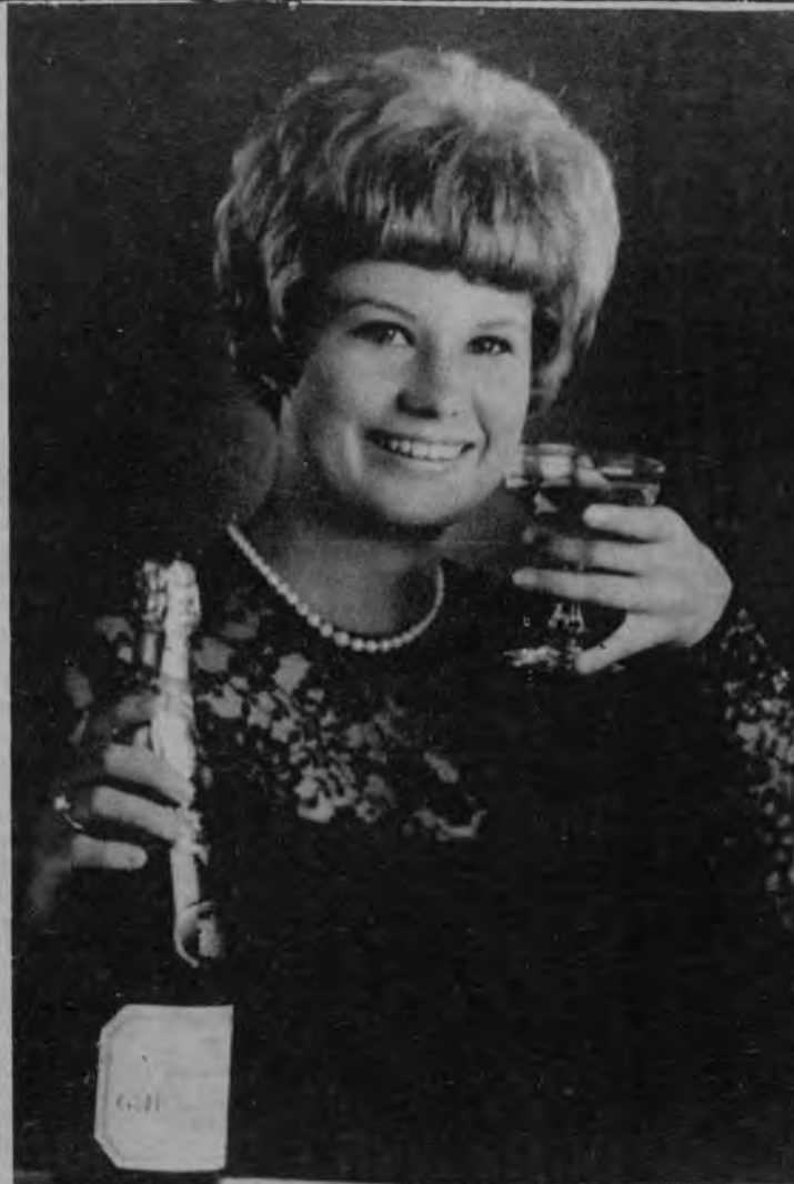
January Calendar Girl

If, however, the sticker has come unglued and has been lost, the student will have to sign an affidavit accepting responsibility should the old sticker show up on another vehicle, before the new permit will be issued. This permit will also be issued without additional charge.