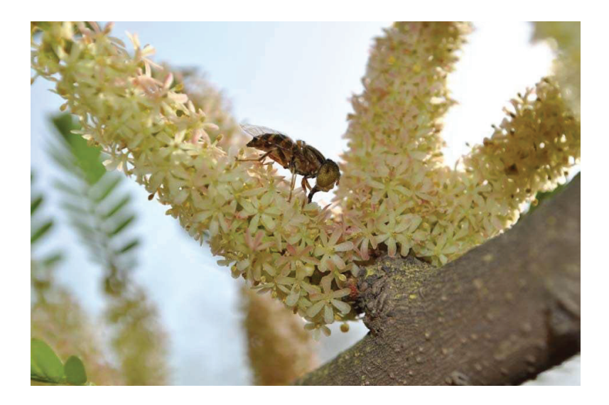
Fig. 7. Sarcophaga sp. visiting the flowers of Aonla