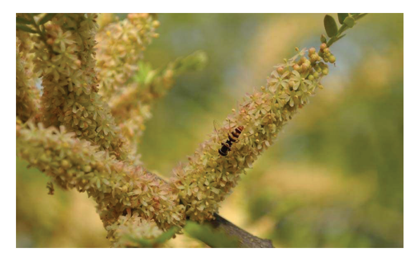
Fig. 8. Syrphus sp. visiting the flowers of Aonla