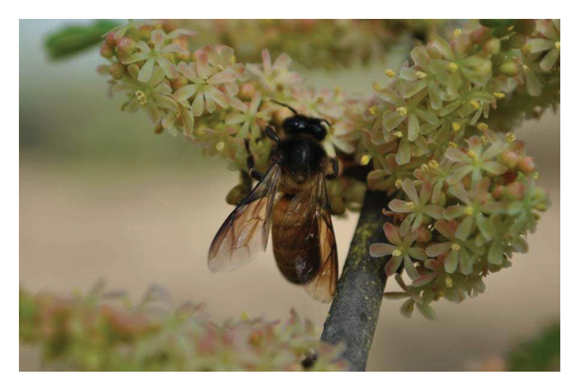
Fig. 3. Apis dorsata visiting the flowers of Aonla

The insect visitors of Aonla flowers visited the crop mainly for pollen collection as it was a good source of pollen but poor source of nectar. The copious anthers bearing pollen on the Aonla flowers were easily accessible to the insects visiting the Aonla blossoms thus serving as the pollinators of the Aonla flowers. The major pollinators were Apis dorsata, A. mellifera, A. florea, Sarcophaga sp. and other insect pollinators from diptera and hymenoptera. All of these pollinators approached the flowers from their front ( Fig. 3–8 ). The honey bee species A. dorsata, A. mellifera and A. florea foraged for nectar and pollen on the Aonla crop and deliberately collected the pollen by scrubbing their legs on the dehisced anthers due to which their bodies got heavily dusted with pollen. There was sternotribic mode of pollen transfer. While working on the flowers, the pubescent hairs present on the ventral side of the bodies and legs of bees got dusted with pollen. The bees thus disseminated pollen from the anthers of male flowers to the stigmas of female flowers and acted as the important pollinators of the Aonla blossoms. The dipterous flies were attracted to the flower mainly for nectar, which was scanty in Aonla flower and served as involuntarily pollinators by the inadvertently transfer of pollen grains from the anthers to the stigmas while attempting to collect nectar ( Fig. 3–8 ).