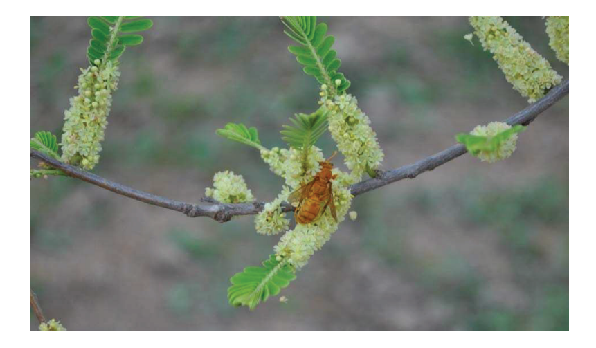
Fig. 6. Pollisteshebraeus visiting the flowers of Aonla