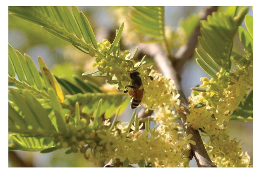
Fig. 5. Apis florea visiting the flowers of Aonla