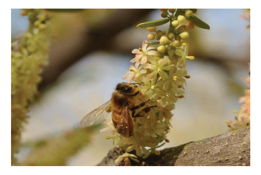
Fig. 4. Apis mellifera visiting the flowers of Aonla