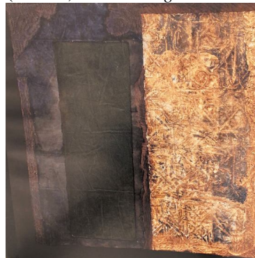
Fig. 3. Yousef Ahmed, The Light Movement (2011). Mixed media and handmade Qatar palm leaf floating in a black frame, 180 by 180 cm. (Ahmed, Full Moon Love Letters 2013, 49).