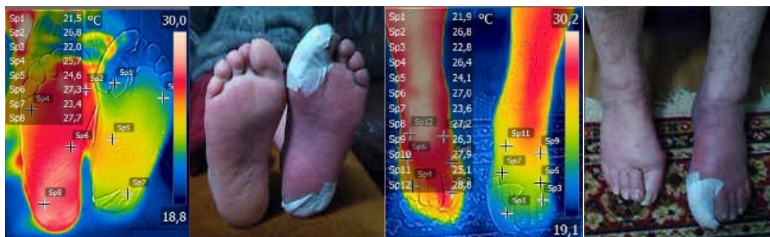
Figure 1. Picture taken from the female sole. Temperature differences ranged from 4.3°C to 5.3°C. Instep side gave from 1.6°C to 4.9°C temperature differences. The left foot (odd numbers) sole and instep were colder than the right one. Clear colour difference is seen in the left foot sole, instep and ankle when compared to right foot.

differing temperatures and redness of the skin which smoothed during bed sore healing. In low lighting conditions infrared imaging may give substantial information about wound condition.