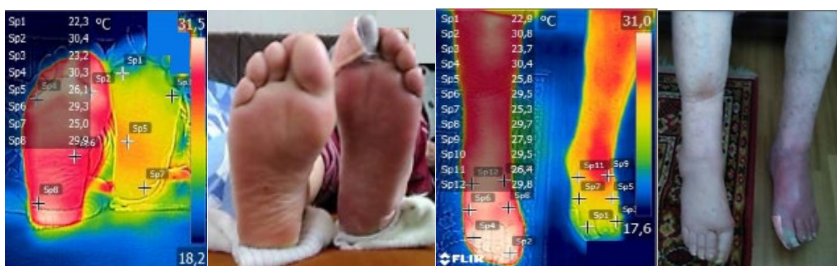
Figure 2. Picture taken from the same female sole as in figure 1 two weeks later. Temperature differences ranged from 3.2°C to 8.1°C. Instep side gave from 1.6°C to 8.7°C temperature differences. The left foot (odd numbers) sole and instep stayed colder than the right one.