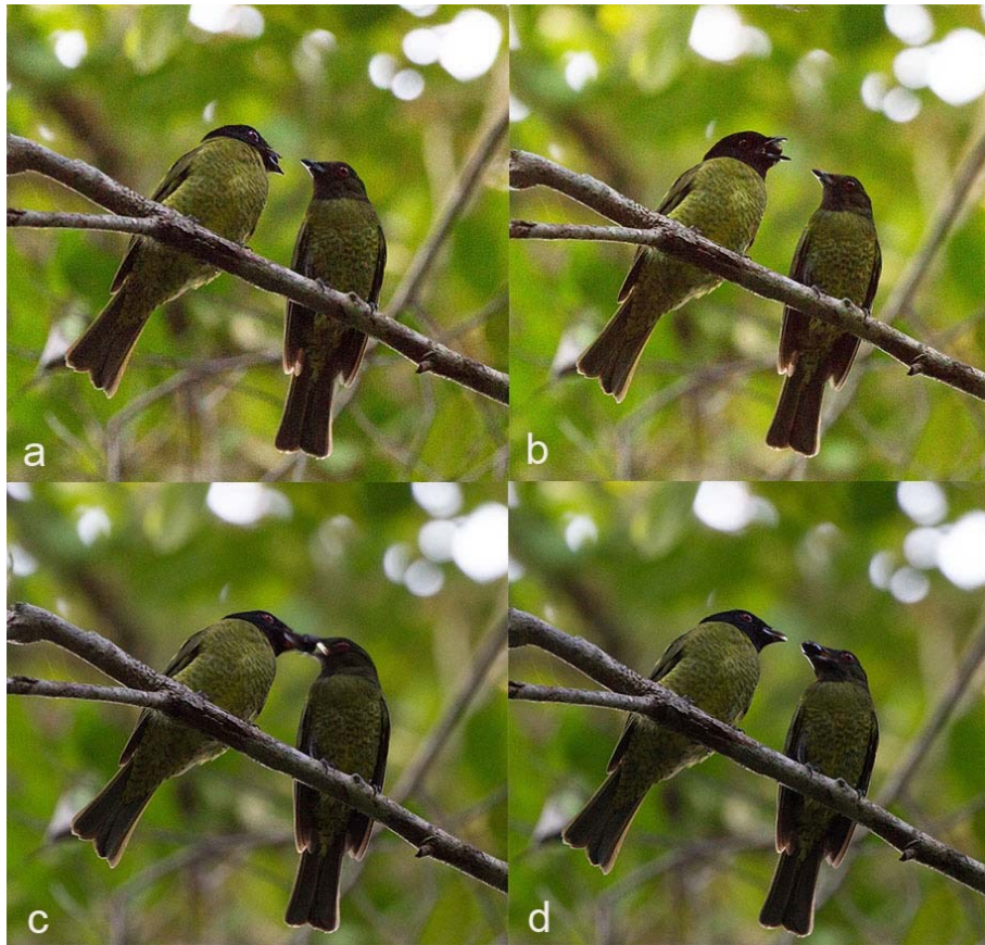
Figure 4. Adult male of the Black-headed Berryeater ( Carpornis melanocephala ) delivering a fruit to an adult female. Black-headed male and greenish-black-headed female. Sequence of images: a, b, c, and d. Photos: Arthur M. Montanhini.

Guerra pers. comm.). The third record was made in the state of Santa Catarina (South Brazil) on 9 December 2015. The male of a Hooded Berryeater pair was observed perched next to the female (WA 1955619) holding a large fruit in its bill. The fourth record was made in the state of São Paulo on 15 July 2018. The image shows two birds perched a certain distance from each other with one (possibly a female) having a fruit in its bill (WA 3039367). Because it is believed that the species does not reproduce during the period of the year when this image was taken (July), it may just be two birds feeding in a fruit tree, a common behavior for this species (FS pers. obs.). The fifth record was made in Macaé de Cima, state of Rio de Janeiro, on 29 November 2019. A male delivered a fruit to an apparent female, then turned its back and flew off (ML 190675171 and 194120061). We also found two records of adult birds feeding subadults (WA 1416771 and 328-0937), identifiable by the striated breast plumage (Snow 1982).