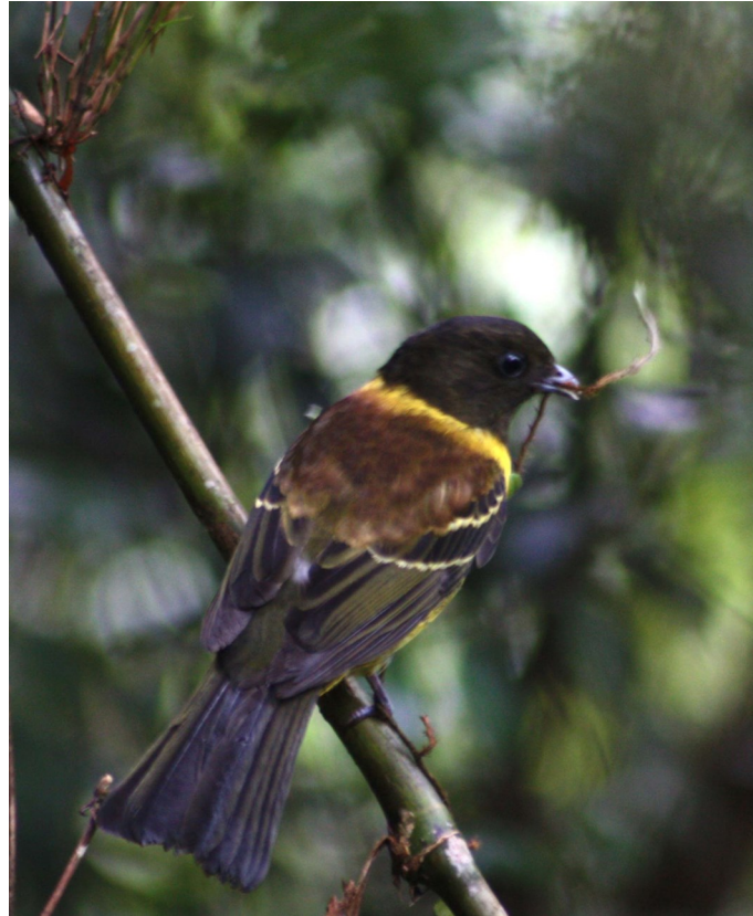
Figure 2. Female Hooded Berryeater ( Carpornis cucullata ) carrying material possibly for nest construction.