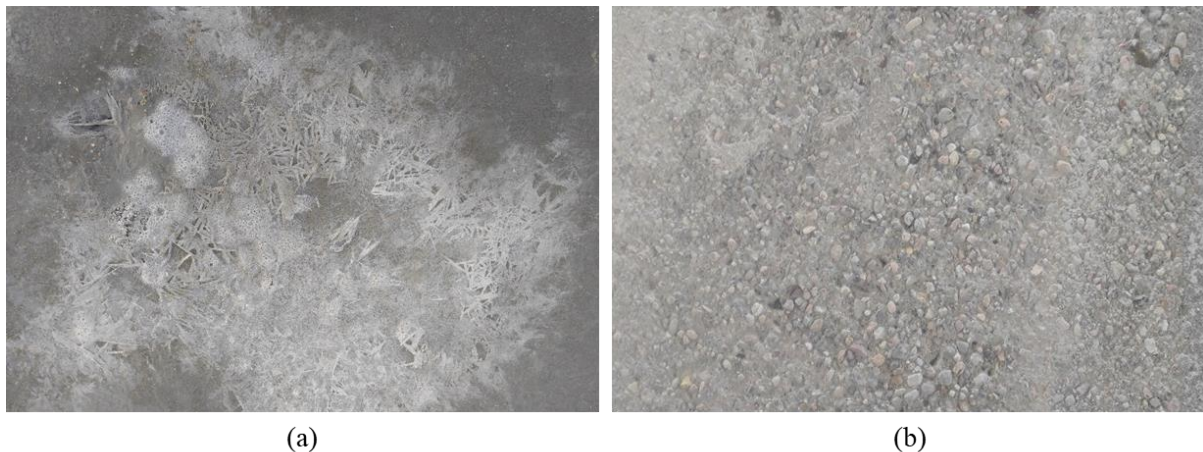
Fig. 4 - Damage to concrete poured in sub-zero temperatures (a) concrete surface freezing; (b) damaged concrete surface by freezing

Another interviewee provided pictures of concrete (Figure 4), along with recounting experiences of pouring concrete in sub-zero weather. Due to the delay in the preceding work, the concrete work, which should have started in July, could be started at the end of November. In order for concrete to function properly, curing at the beginning of casting is highly crucial, thus, it is not recommended to pour concrete in cold weather. However, if the concrete work was not carried out, it was impossible to proceed with the subsequent works, so a serious delay was unavoidable. After much consideration, the person in charge of the construction site managed by the interviewee decided to push ahead with concrete work in winter to make up for the delay. Thermal insulation was carried out using a hot air blower and bubble sheet, but damage from freezing as in Figure 4 was observed in various spots. The interviewee also said that the site manager's decision to do concrete work in the winter was unacceptable as an engineer, but understandable as the head of a family and an employee under pressure from superiors.