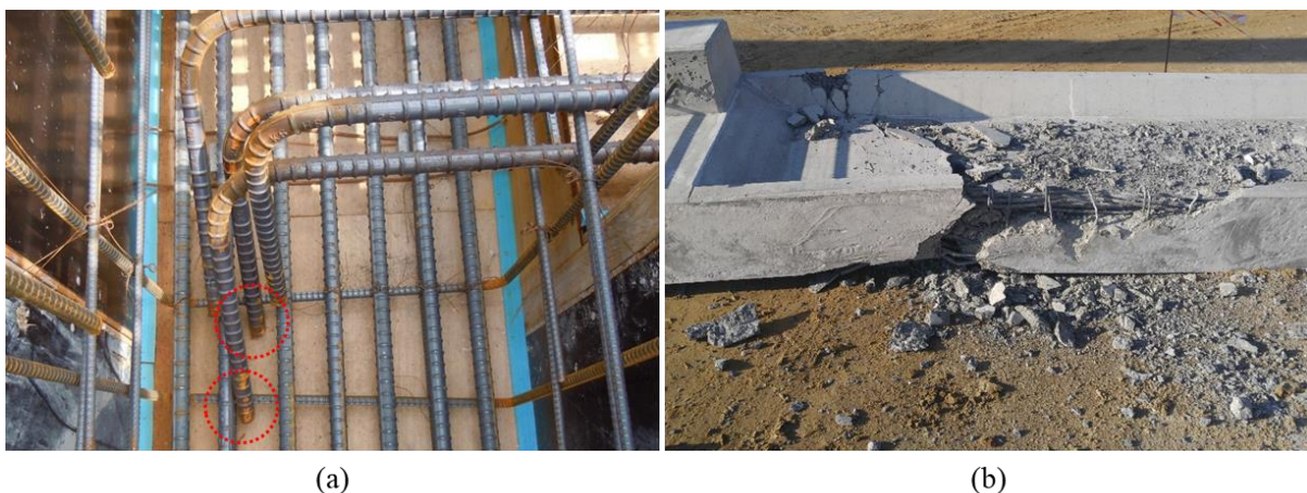
Fig. 3 - Examples of rework (a) inappropriate cover depth; (b) damaged precast concrete during construction

The extent of delay due to rework depends on the scope of the work and when the defect is discovered. As shown in Figure 3(a), if the reinforcing bar directly touches the formwork or the appropriate cover thickness is not secured, immediate correction is possible on site, and although it may take some time, there is no critical delay in most cases, while reworks combined with the demolition of concrete due to incorrect construction and re-ordering of damaged ready-made materials prolong the period of activity, resulting in resource over-allocation (Figure3(b)). In this case, external factors such as weather conditions, curing duration, supplier schedules, and material transport should be taken into consideration and these factors can cause significant delays in projects. In extreme cases, structural instability or illegal design and construction may require complete demolition and reconstruction, resulting in widespread delays for years. In 2014, the 28-day compressive strength of the concrete wall of an apartment under construction in Korea did not meet the design standards, hence, the building was completely demolished and reconstructed.