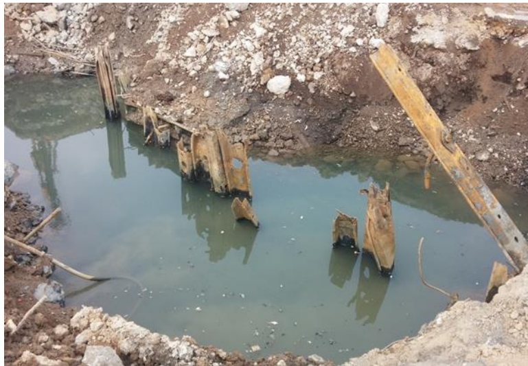
Fig. 2 - Underground obstructions found during excavation work

In the latter case, on the other hand, design changes occur for unexpected reasons unless the construction is physically performed. For example, as shown in Figure. 2, construction was delayed due to the presence of unexpected obstacles or underground structures during excavation work. Although the design documents included the results of underground exploration, physical underground exploration was rarely carried out for the entire area of the construction site, thus, underground obstacles and underground facilities that were not recognized in a specific spot may be found during construction. One interviewee recounted his experience with the discrepancy between the drawings and the actual construction site. The tasks he managed were to demolish the masonry bricks covered on concrete walls and finish the concrete wall with paint. During the masonry demolition work, it was found that the space between the concrete wall and the masonry was filled with cement mortar. In general, in the combination of concrete wall and brick finish, the mortar is not applied to concrete vertically, thus, only the removal of bricks was reflected in the scope of work. Consequently, unscheduled time was taken for removing the cement mortar from the wall, and additional costs such as waste disposal costs were incurred. As can be seen in these cases, the discrepancy between the site and the design document was selected as a major delay factor in the following literature [13,15,17].