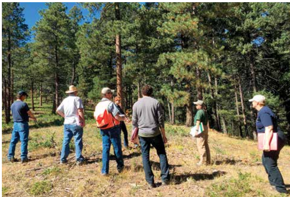
Figure 2: The sale administrator briefs the monitoring team and answers questions prior to a site visit.

Site nominations were solicited from one USDA Forest Service supervisor office, four CSFS field offices