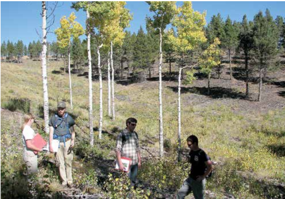
Figure 3: The monitoring team inspects skid trails and the Streamside Management Zone.