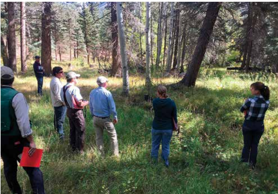
Figure 4: The monitoring team works on reaching consensus on BMP application and effectiveness ratings.

and the CTIA Executive Committee and local CTIA membership list. One private site was eliminated prior to the monitoring site visits due to a lack of surface water. This was used as a “practice” site for the monitoring team’s new members. Another nearby, recently harvested site on private land (site #1) was selected as a replacement before the first day of the