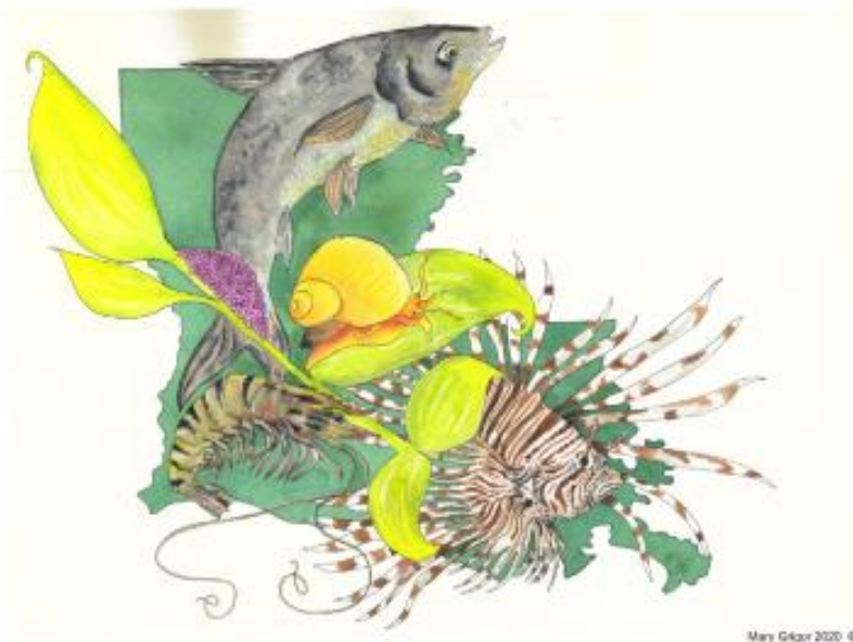
Mary Giger 2020 ©