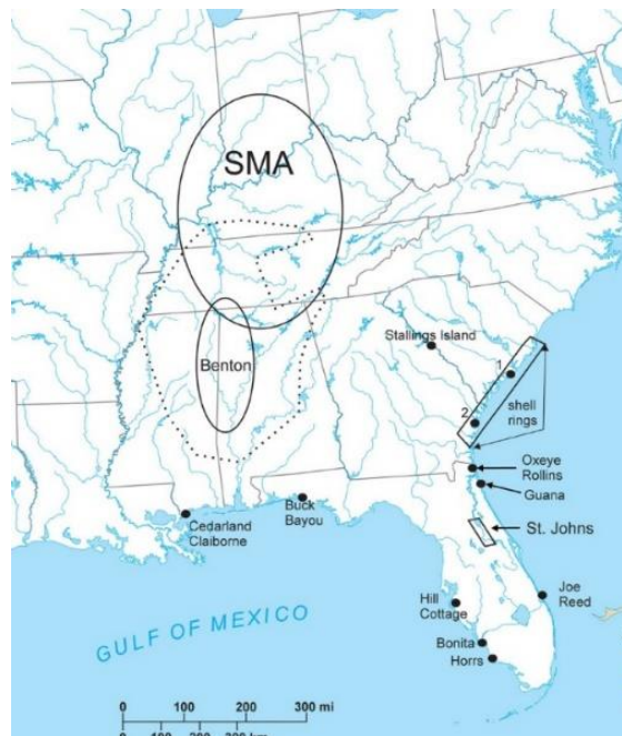
Figure 1. Shell Mound Archaic (SMA) with dotted line noting Benton Interaction Zone and shell ring sites of the Carolinas and Florida/Gulf coasts (after Kidder and Sassaman 2009).

to culturally buffer themselves against varying environmental and social risks and are equipped to respond to these challenges in ways that promote resilience/adaptation and cultural persistence (Temple and Stojanowski 2019).