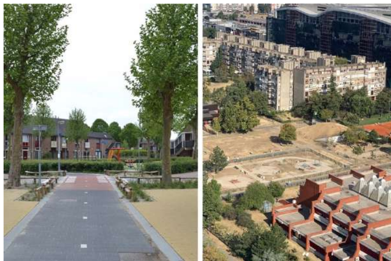
Fig.2 – a) Almere Haven (left), Photography © Lidwine Spoormans 2018; b) New Belgrade (right), Photography © Zorana Jovic, Student Workshop, Belgrade, 2020.

In the specific method for Almere Haven, informants were asked to keep a diary, responding to two questions or assignments per day, for one week. Completion of the diary notes is done by the participants independently, and 55 diaries were returned and completed. The questions and assignments include aspects of the urban scale and architectural scale, relating to the living environment of the individual resident. Respondents are residents of Almere-Haven and were approached by encounters in public space, snowball method (a respondent suggests or recruits others) and two group meetings with children and elderly.