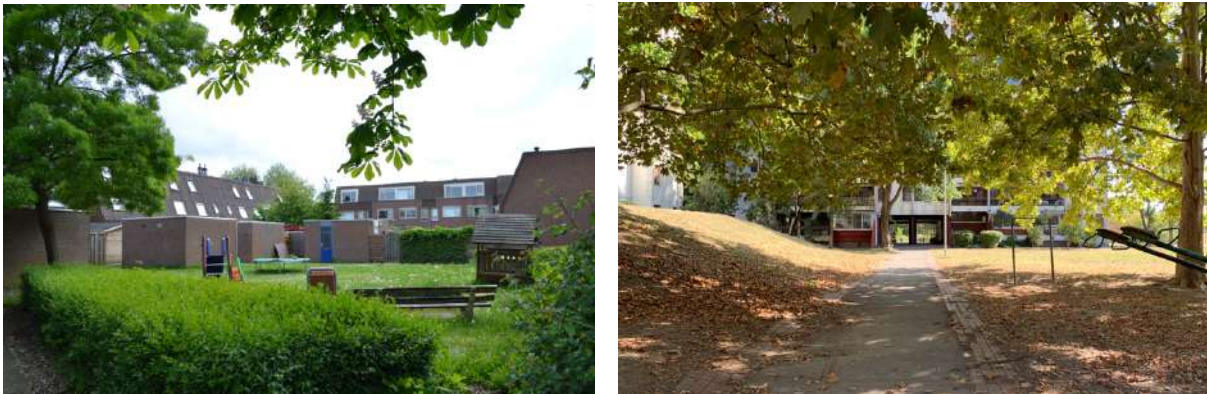
Fig.3 – a) Almere Haven (left), Photography © Lidwine Spoomans, 2018; b) New Belgrade (right), Photography © Zorana Jovic, Student Workshop, Belgrade, 2020.

Green areas and playgrounds are the absolute winners in public space (Fig. 3). However, the type of space, the layout and programming make a difference. Apart from the extensive park-like areas with mature greenery, especially the smaller scale public places integrated in the residential neighbourhoods are appreciated. “No one has time or initiative to do something in the collective spaces. Only the kids’ playgrounds are important for us.” (resident, New Belgrade). So again, children are often drivers, as expressed by a young participant in Almere Haven as well: “We have two courtyards, one with a playground and one with a garden. I like the courtyards because they are next to my house and it is where I meet my friends. It is nice to have a lot of freedom to imagine games to play.” (resident, Almere Haven). In future developments, public green spaces are key values in spatial terms, enabling social contact and feelings of freedom.