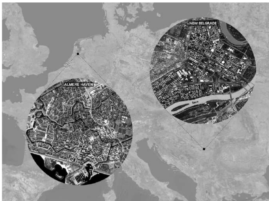
Fig.1 – Two case studies: Almere Haven, Netherlands and New Belgrade, Serbia. Illustration by the authors, adapted from http://www.bing.com/maps , accessed on 23 January 2018 and 29 June 2020.

The middle-class mass housing (MCMH) areas in Europe have for a long time received very little attention since most of the studies on housing favoured either the theme of high-class single-family houses or the other extreme, social housing for low-income families (Milheiro et al. 2018, 44). Nevertheless, MCMH is an emerging research topic in recent studies in several European countries and is further receiving more attention internationally. Aiming to contribute to the emerging discussion and existing knowledge on MCMH, the paper presents a comparative study on two examples of MCMH in Europe: New Belgrade (Serbia) and Almere Haven (The Netherlands).