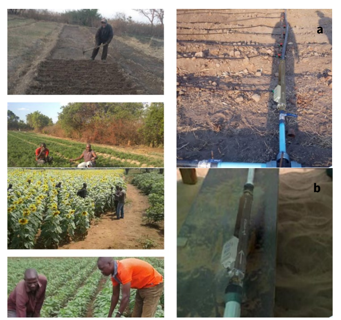
Fig. 4. Application of EVOagri technology in Africa.

The images show the application of EVOagri technology in Africa are presented in Fig. 4 a, b.