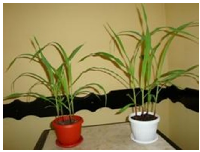
Fig. 5. Results with corn seeds of Zea mays L.

filtered water which was saturated with EVOdrop hydrogen technology called EVObooster. This water was saturated with EVOdrop hydrogen technology with pH=7.3; ORP=-390 mV; concentration of Hydrogen (H<sub>2</sub>) 1.2 ppm. The control sample was with solute concentration 168 ppm. The sample was filtered from tap water with EVOdrop technology and was with 7 ppm. There were performed 10 measurements and the results are statistically significant with t-test of Student (p<0.10). The results were achieved with EVOdrop filtered device with Haberlea rhodopensis Friv (13). The effects of hydrogen (H<sub>2</sub>) were described in (14)