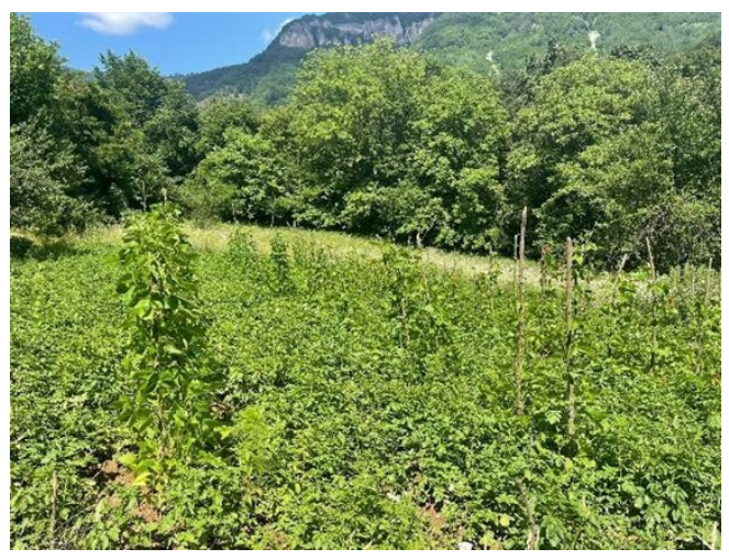
Fig.7 Results with beans.

importance of water quality for its absorption by vegetables and for increasing their productivity. An additional analysis was done with f(E) and NES. The function f(E) is spectrum of distribution according to energies. NES is Non-equilibrium Energy Spectrum (NES). The Non-equilibrium Energy Spectrum (NES) and f (E) is measured in eV<sup>-1</sup> (20, 21). Antonov's method for discrete evaporation of water drops as a physical effect was published at Harvard University (22). It is the basis for the spectral method NES (23, 24). These parameters are related to the ability of water molecules to bind into clusters, and to penetrate through the cell membrane of the plants (25-29). Table 2 illustrates the results of the comparative analyses between EVOdrop water and other waters (13, 30).