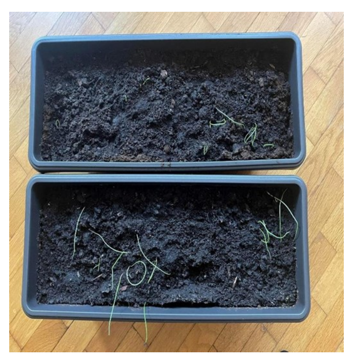
Fig. 6. Results (15<sup>th</sup> day) with onion seeds, watered with Tap water (control sample), EVOdrop filtered water, saturated with hydrogen from EVOdrop hydrogen technology (sample).

In this regard, in Bulgaria, and in Europe in general, water filtration with zeolite is quite widespread (15-17). Shungite filtration is also applied in Europe (18-20). The achieved results of EVOagri project in Africa show the