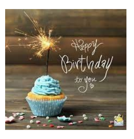
Tammye Raster--January 16 Jenny Fox--January 16

We would like to celebrate your birthday too! We need your permission first, so please fill out the form <u>here</u>.