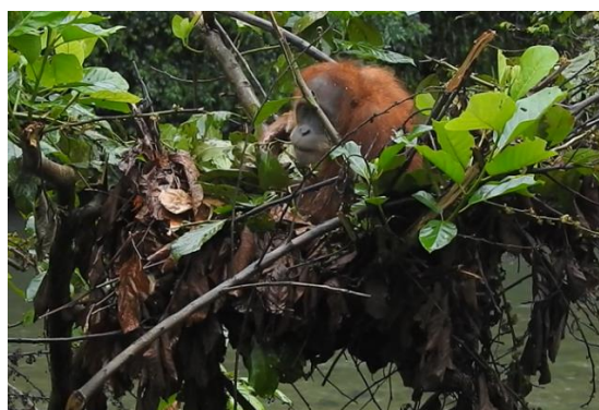
Figure 5 Irregular nest of released Sumatran orangutan

This form is usually from the old refurbished former nest, by adding new branches to the nest (Figure 5).