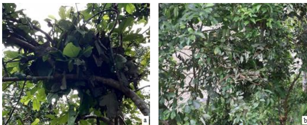
Figure 4 Single flat shape (a) and stratified shape (b) nests.

The shape of this nest is made of branches composition that are bent along with a few piles of leaves to make it comfortable when occupied as well as other forms of orangutan nest architecture (Figure 4b). Its shape has two parts. The bottom is served as a bed, and the top is shaded as a protector (such as a roof). It consists of different layer thicknesses between the base and the roof. Usually, the roof has a thinner thickness compared to the base one.