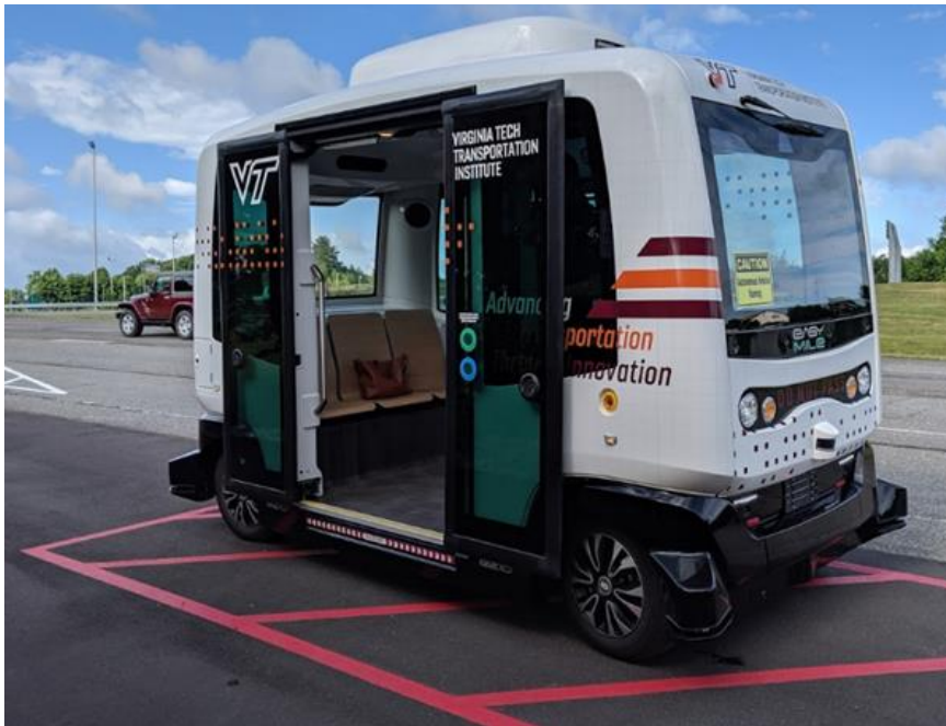
Figure 2. A photograph of the VTTI EasyMile LSAV that was implemented for this project. Although much time and effort were spent achieving this task, human participant testing in-person with the vehicle, or otherwise, was forestalled by the occurrence of the COVID-19 pandemic. Revised university experimental protocols that protected human participants were implemented and maintained throughout the data collection phase of work. The research team developed an alternative approach that used multimedia, electronic surveys, and remote online meeting tools to complete the project.

The original study plan included prerequisite implementation of an LSAV in a real-world operating environment at VTTI so that study participants would have a very realistic experience with respect to their use of the vehicle. Figure 2 and Figure 3 show the LSAV that was acquired for this study and the route over which that it was operated between VTTI and a nearby Blacksburg Transit bus stop. A second Center for Advanced Transportation Mobility project report documenting these activities is planned as an accompanying report to this document.